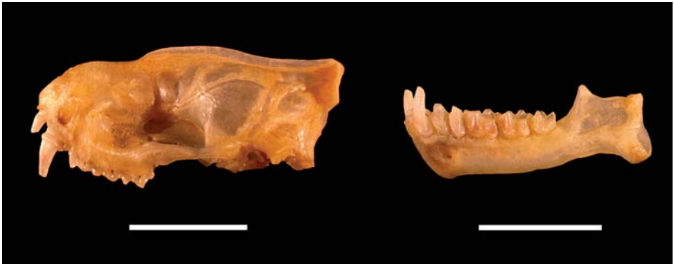
Fig. 3. Skull and mandible of the newly collected specimen of the Midas free-tailed bat ( Mops midas ) from near Haqw, Saudi Arabia (NMP 96880). The scale bars = 10 mm.

Both findings were made from colonies roosting in hollow trees (Hayman 1954, Nader 1982); the latter record undoubtedly represented a nursery colony.