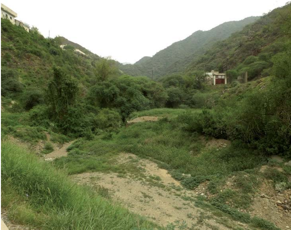
Fig. 2. The Asir Mountains, ca. 7 km south of Haqw, the locality of the new record of the Midas free-tailed bat ( Mops midas ) in Saudi Arabia.