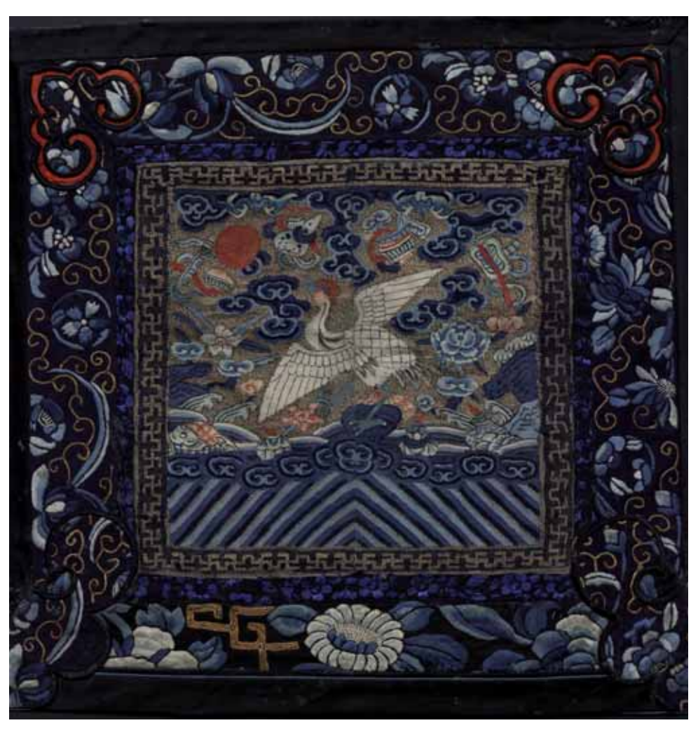
Fig. 1: Rank Badge, Inv. No. A1786.