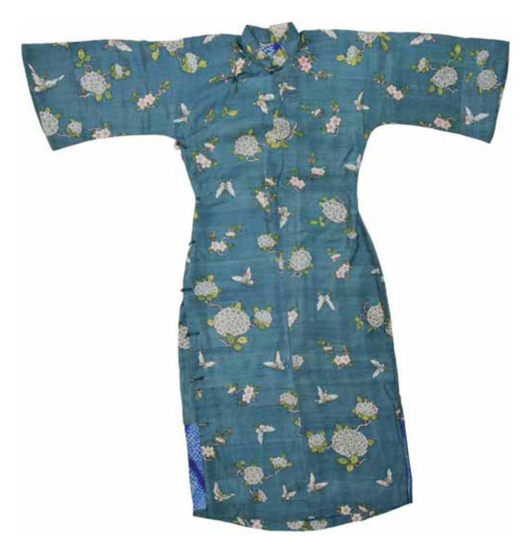
Fig. 2: Qipao Dress, Inv. No. 46674.