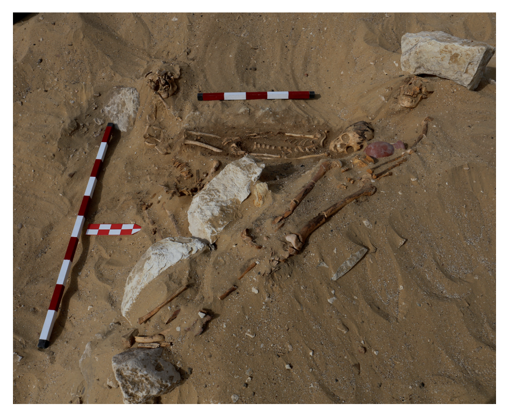
Fig. 7 Burial of an older child and adolescent female show a close connection of the two deceased individuals, and another adult individual underneath (excav. no. DJ-F139-2018, skeletons 14, 16–17)