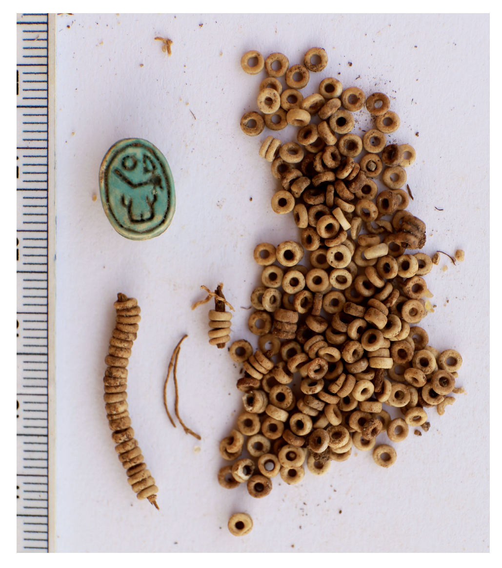
Fig. 2 The grave goods found with the burial of an older child (excav. no. DJ-F76-2018, skeleton 5).