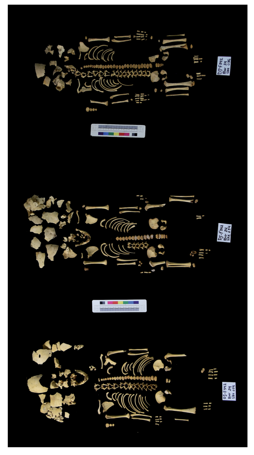
Fig. 3 Probable twins (left and middle) were buried besides the small tomb of another, younger infant (right) (excav. no. DJ-F342-2018, skeletons 33–35).