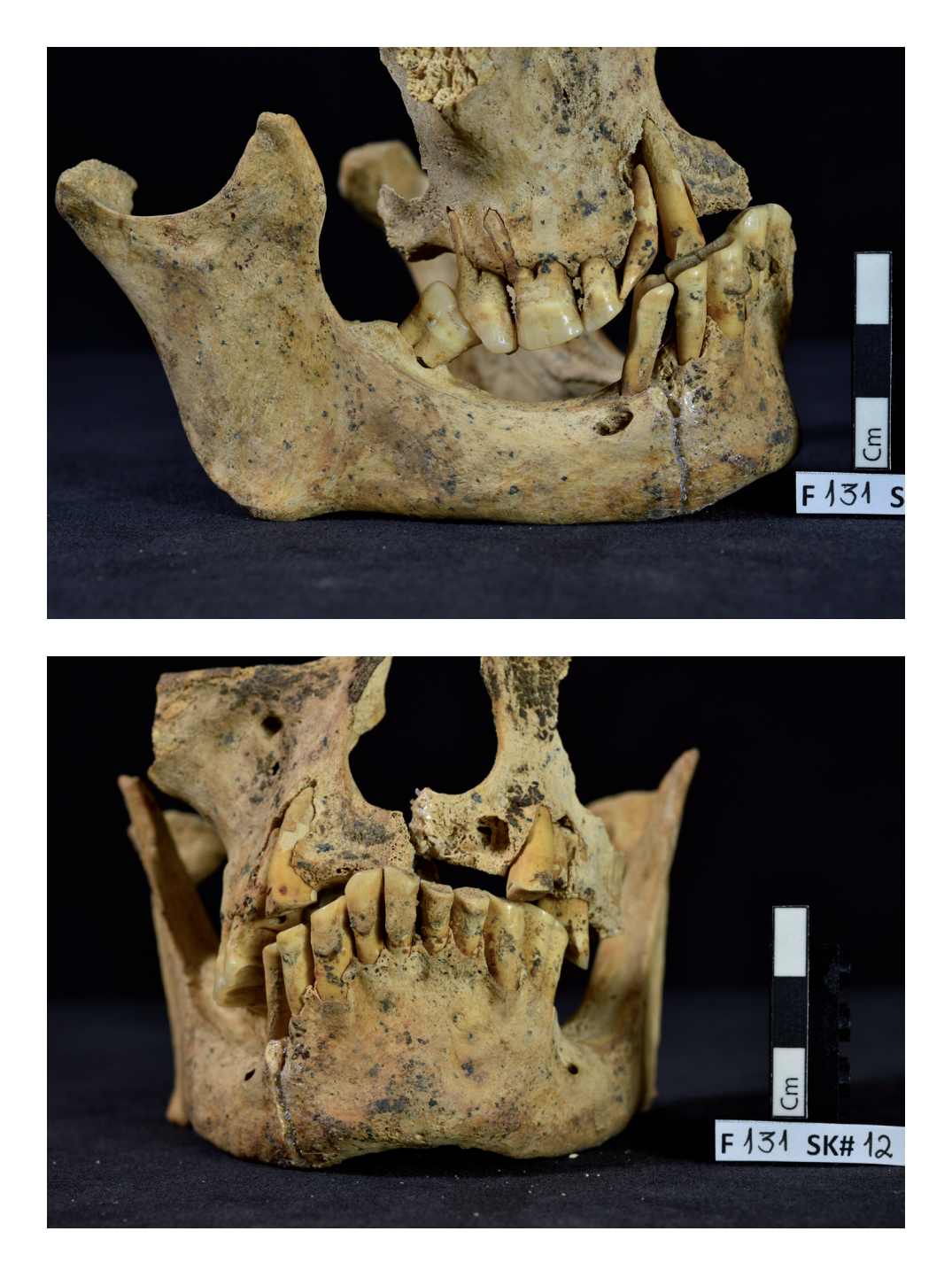
Fig. 9a–b Detail of the jaws of the adult middle aged female (excav. no. DJ-F131-2018, skeleton 12) showing a generally poor dental health including ante-mortem loss of teeth