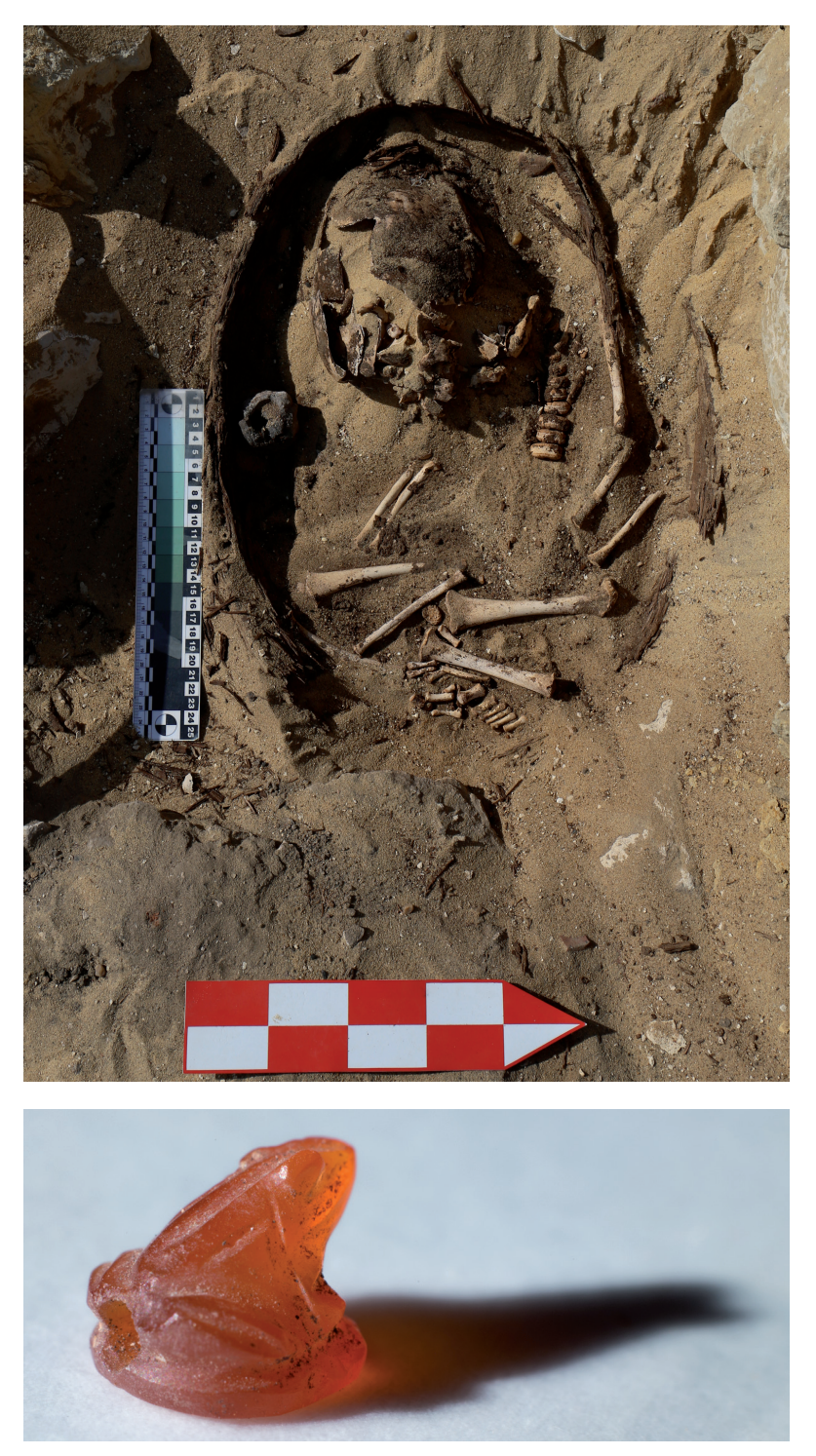
Fig. 4a-b Infant buried in a basket with an amulet of a frog.