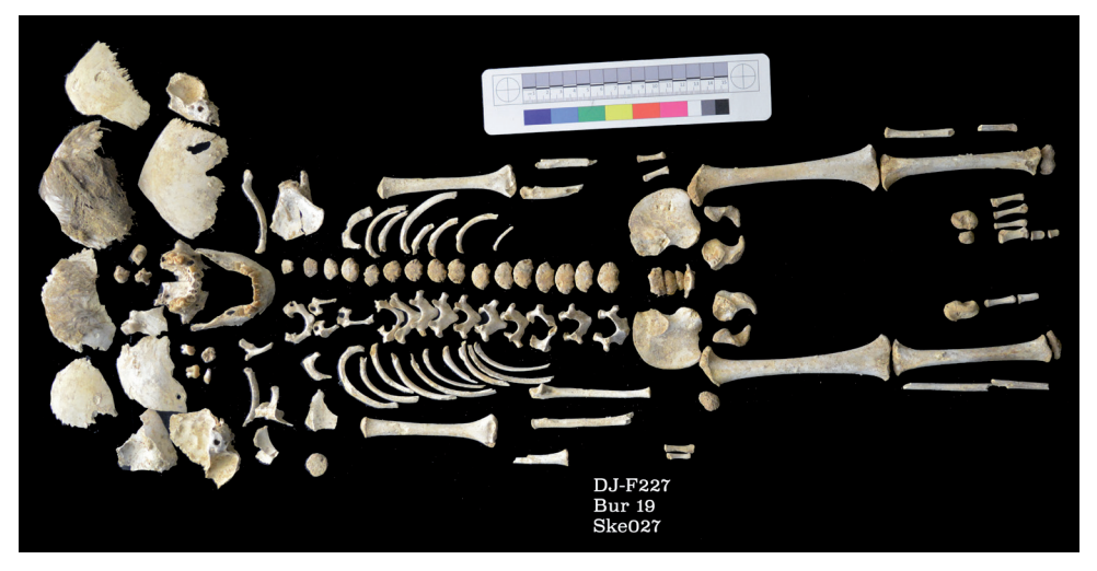
Fig. 8 The well-preserved skeleton of a younger child (excav. no. DJ-F227-2018, skeleton 27)