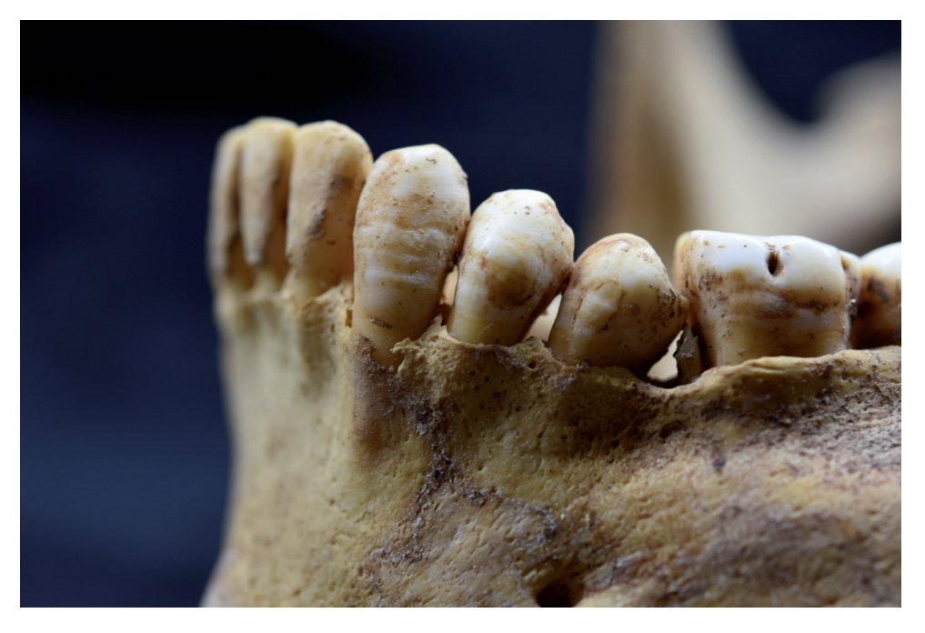
Fig. 6 Detail of the linear enamel hypoplasia of the adolescent (excav. no. DJ-F190-2018, skeleton 24) indicating malnutrition