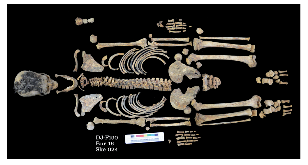
Fig. 5 Skeleton of an adolescent probable male (excav. no. DJ-F190-2018, skeleton 24)