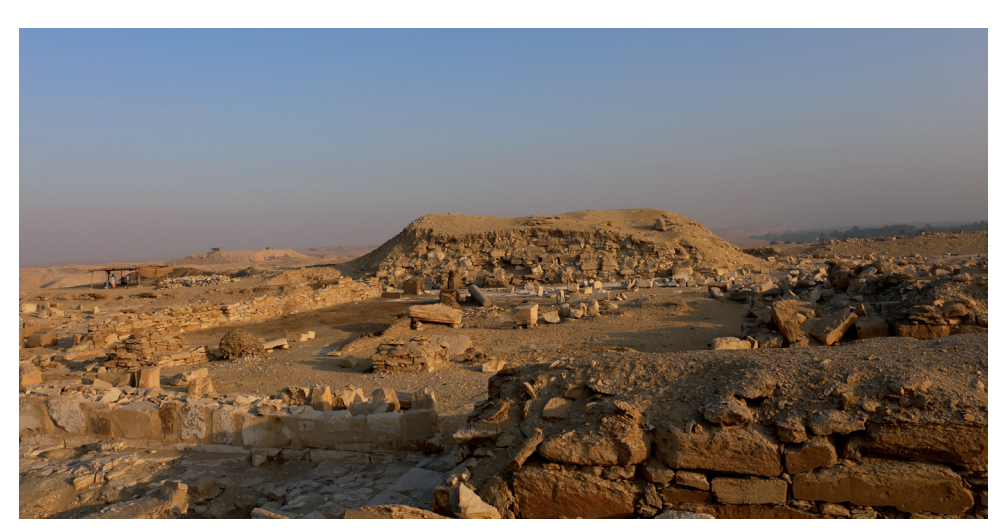
Fig. 1 The T.g area after its exploration in 2018.

Preliminary plan of the explored T.g area with the position of the selected group of burials (drawing Hana Vymazalová, after Megahed – Jánosi – Vymazalová forhtcoming).