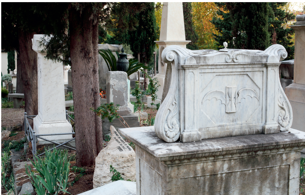
Fig. 14. The grave of Pierre WAGNIÈRE (1806–1857) in the Cimitero degli Inglesi (the English cemetery) in Florence (photo by J. RYDELL, 2017).

Obr. 14. Hrob Pierra WAGNIÈREA (1806–1857) na Anglickém hřbitově ve Florencii (foto J. RYDELL, 2017).