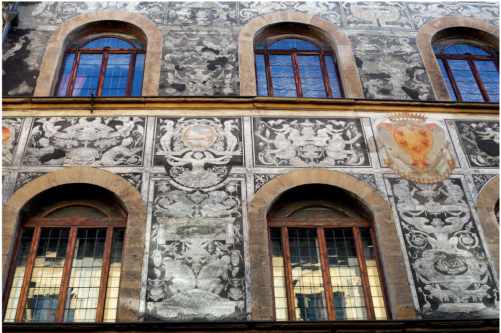
Fig. 3. Palazzo di Bianca CAPPELLO with the decorated facade, refurbished by Bernardo BUONTALENTI 1573–1578 and Bernardino POCETTI 1579–1580.