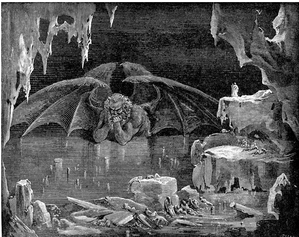
Fig. 12. Lucifer residing at the bottom of the Inferno, devouring the condemned souls. Illustration to the Comedia by Gustave DORÉ (1861–1868). Wikimedia Commons.

Obr. 12. Lucifer pobývající na dně Pekel a požírající zatracené duše. Ilustrace díla Comedia od Gustava DORÉHO (1861–1868). Wikimedia Commons.