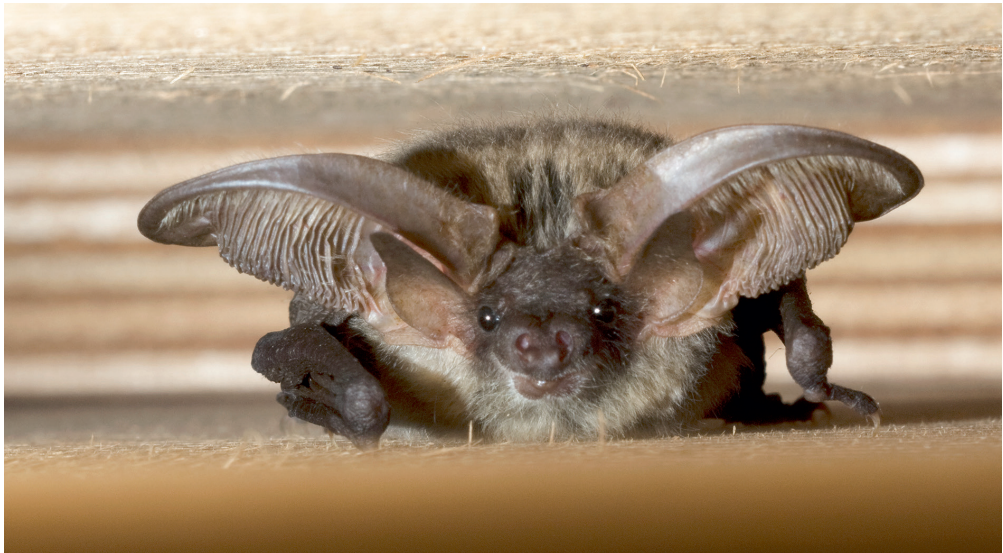
Fig. 11. The grey long-eared bat ( Plecotus austriacus), the presumed model of some of MICHELANGELO’s and BUONTALENTI’s bats.

By far the most familiar of the early Florentine writers was Dante ALIGHIERI (1265–1321), most famous for his poem Comedia (later renamed Divina Commedia ), and one of the most important writers of all times. He was active more than a century before the Renaissance, but we include him here because he was from Florence and used the image of bats in his work, thereby presumably influencing the employment of this motif by his successors. In the last canto (XXXIV) of the first part ( Inferno = Hell) of the Comedia , the deepest part of the Inferno is described in