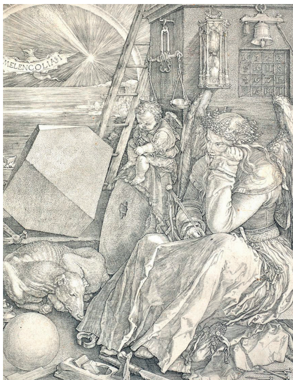
Fig. 2. The engraving Melencolia I, illustrating one of the four humours, melancholy. Albrecht DÜRER, 1514.