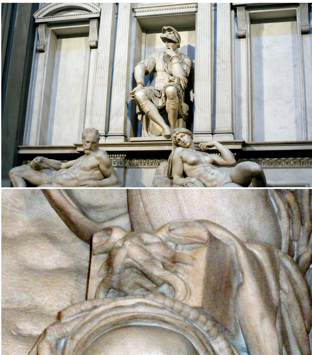
Fig. 8. The central statue of the tomb of Lorenzo DE' MEDICI duca di Urbino (1492–1519) in the Sacrestia Nuova of San Lorenzo or Cappelle Medicee (top). The lord has a box on his left knee (below), with the front showing the face of a bat. Obr. 8. Ústřední socha hrobky Vavřince MEDICEJSKÉHO, vévody urbinského (1492–1519) v sakristii kostela Svätého Vavřince neboli Medicejské kapli (nahore). Bůh má krabičku na levém kolenní (dole), s hlavou netopýra zpodobněnou na přední stěně.