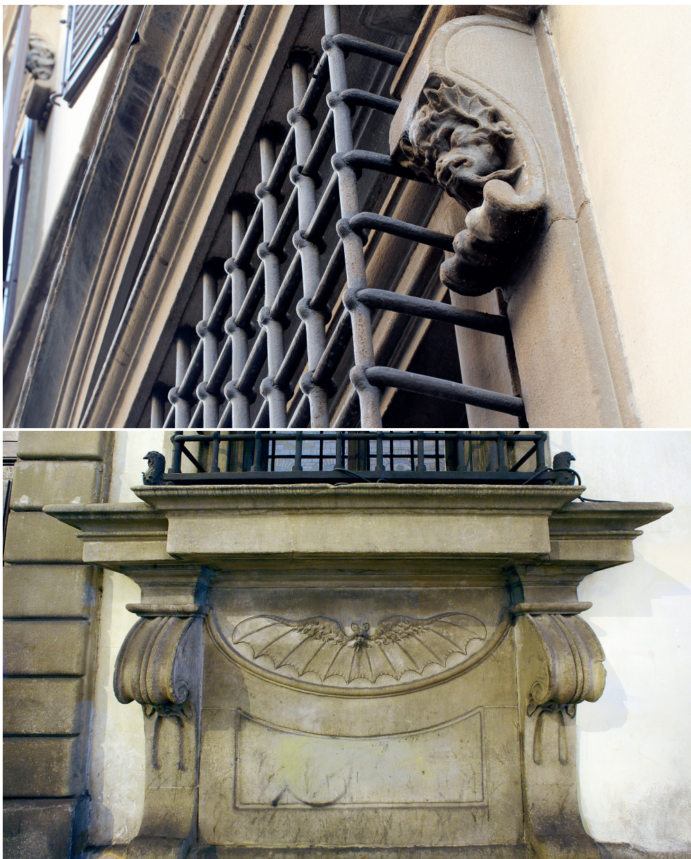
Fig. 6. Bats decorate the windows of Palazzo Capponi-Covoni in the style of BUONTALENTI, but they were actually made by Gherardo SILVANI in the early seventeenth century. Obr. 6. Dekorace oken Paláce Capponi-Covoni netopýry ve stylu BUONTALENTIHO, ve skutečnosti však zhotovenými Gherardem SILVANIM na počátku sedmnáctého století.