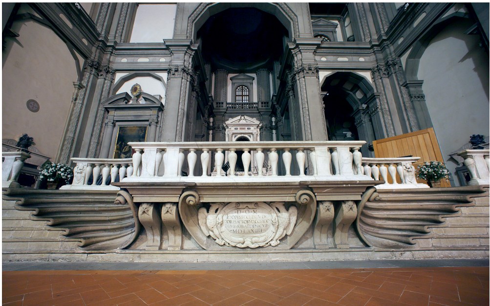
Fig. 7. The staircase of Santo Stefano al Ponte with the pattern of bat wings (photo by J. RYDELL, 2017). Obr. 7. Schodiště kostela Svatého Štěpána U mostu s tvary netopýřích křídel (foto J. RYDELL, 2017).

Finally, BUONTALENTI or possibly Gherardo SILVANI could also have been responsible for the bat motif of the window of Palazzo di Perna in Pistoia, a city not far from Florence. It is a beautiful kneeling window, possibly coeval of Palazzo di Bianca CAPPELLO (1570–1574). Here the bat is not located under the sill but above it, inside the pediment (DANIELE 2004).