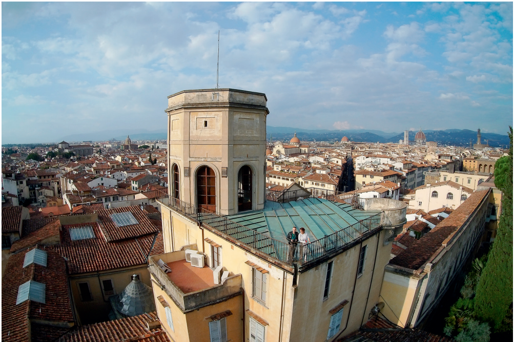
Fig. 1. View over La Specola and Florence (photo by P. AGNELLI, 2017).

Some renowned Renaissance artists such as Bernardo BUONTALENTI, Gherardo SILVANI (1579–1675), a disciple of BUONTALENTI, and Michelangelo BUONARROTI used images of bats in their works. BUONTALENTI in particular seemed to be fond of these animals, as he depicted them frequently. He and his followers created fanciful decorations typical of the late Italian Renaissance, known as Mannerism, in the form of grotesque masks with or without wings, and such figures characterize the different architectural elements with particular symbolic meanings, most of which are hard to understand or interpret today (Kamela GUZA, pers. comm. 2016). BUONTALENTI was perhaps the most important architect in the late Renaissance in Florence, where he owned a vegetable garden bordering the famous Boboli Garden (FARA 1995). This is also where he built the Grotta di Buontalenti , also known as Grotta Grande (Big Grotto),