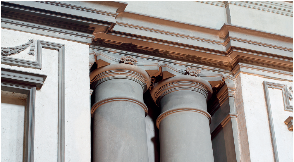
Fig. 9. “Michelangelo’s Vestibule” in the Biblioteca Medicea Laurenziana, with columns from which faces of bats overlook the entrance to the library.