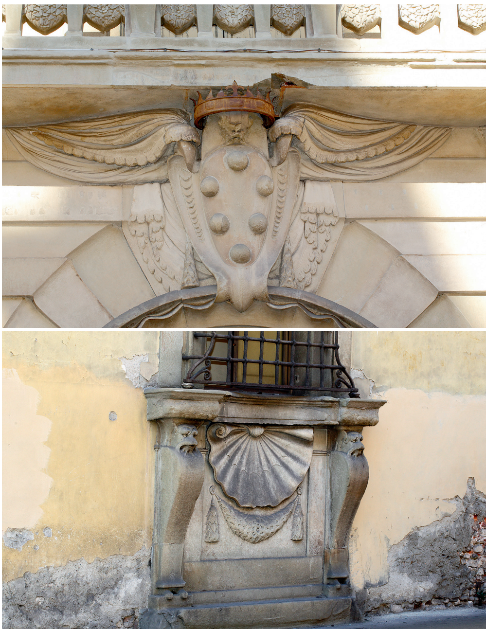
Fig. 5. Casino Mediceo di San Marco, with portal (top) and window sills (below) (photo by J. RYDELL, 2017). Obr. 5. Casino Mediceo Svatého Marka: portal (nahore) a okenní podprseň (dole) (photo by J. RYDELL, 2017).