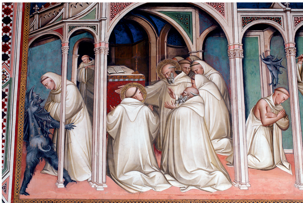
Fig. 13. One of four adjacent frescoes in the sacristy of San Miniato del Monte in Florence, illustrating the life of San Benedict. Spinello ARETINO ca. 1387 (photo by J. RYDELL with permission from the Monastery of San Miniato al Monte, Florence, 2017; a reproduction of this picture is strictly forbidden).

V příspěvku upozorňujeme na užití motivu netopýra (Chiroptera) ve florentinském renesančním umění. Michelangelo BUONARROTI, Bernardo BUONTALENTI, Albrecht DÜRER a někteří další použili motivu netopýra ve svých skicách, sochách a ozdobných prvcích architektury a mnohé netopýří motivy jsou dosud k vidění na palácích a památkách v Historickém centru Florencie, památce světového dědictví UNESCO. I když jsou motivy netopýrů vesměs umělecky velmi stylisované, často strašidelné, a téměř nikdy neodpovídají morfologické skutečnosti, netopýří jsou obvykle dobře rozpoznatelní podle velkých ušních boltců a typických létacích blan. Podle některých názorů mohou být určité motivy vykládány spíše jako ptačí než