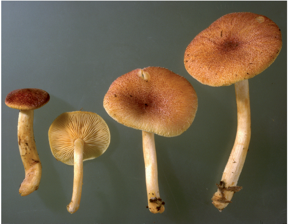
Fig. 1. Basidiocarps of Tricholomopsis flammula (WU 13075).

Contextus luteus usque ochraceo-luteus. Sapor mitis. Odor indistinctus. Basidiosporis 5.2-8.0 x 3.2-4.8 \mu\text{m} , plerumque ellipsoideis, minus obovoideo-ellipsoideis, ovoideo-ellipsoideis usque oblongis, raro late ellipsoideis vel leviter phaseoliformibus in aspectu laterali. Cheilocystidiis magnis, plerumque clavatis. Pleurocystidiis abundantibus, plerumque cylindraneo-fusiformibus vel anguste clavatis, contenu homogeneo, aliquot refractivo, pallide luteo. Hyphis omnibus fibulatis. Holotypus: Gallia, montes Jura, 2 Oct. 1944, leg. et det. G. Métrod 1444 (PC 0096810).