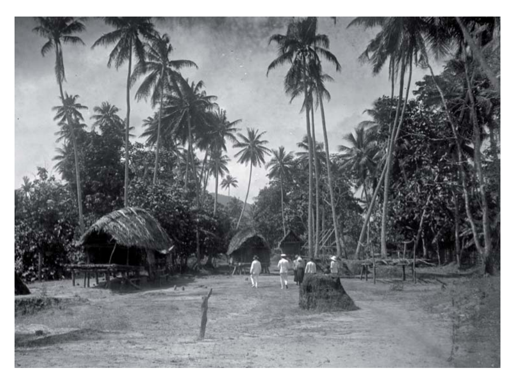
Fig. 3 A village in New Guinea, undated (AO I 113).

the adjacent villages, toured the islands of Samarai and Misima, continued to New Britain and from there back to Sydney via Cairns, Townsville and Brisbane. On Christmas of that year, they explored Tasmania and on Easter 1922 went to the North West and Northern Tablelands regions of New South Wales.