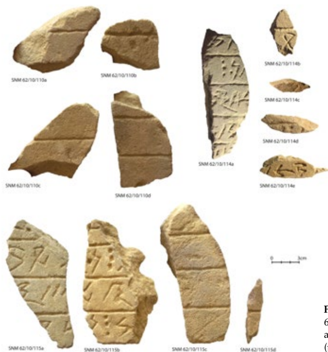
Fig. 4. Stela(e) fragments SNM 62/10/110a-d, SNM 62/10/114a-e, and SNM 62/10/115a-d.