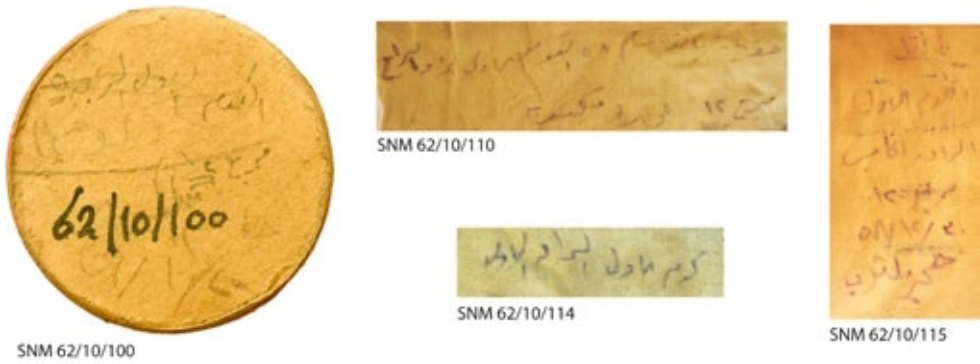
Fig. 1. Object labels for the sealing and the three groups of stela(e) fragments.

designations of squares (2 and 1 and 12, respectively). Squares are also mentioned in the find entries for three lion statuettes from the temple (namely squares 13, 14, and 19). 16 Thus, the existence of a square grid established over the mound by the archaeologists, with a minimum of 19 sections, can be assumed. Interestingly, this is corroborated by the plan of the site put together in the collaboration of Mutasim Hussein and Salah in 1958, 17 showing a square grid of five by five (i.e. 25) sections over the respective mound. 18 It is further evidenced by photographic documentation from the excavations capturing what almost certainly were stakes delimiting the square grid. 19 Unfortunately, the numbers in the labels cannot be assigned to any of the individual sections of the grid.