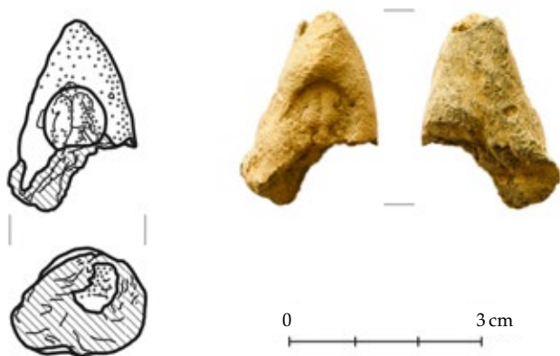
Fig. 2. Sealing SNM 62/10/100 (drawing: Vlastimil Vrtal).

The find complements two other pieces that come from the northern sanctuary (WBN 507) of the temple. 35