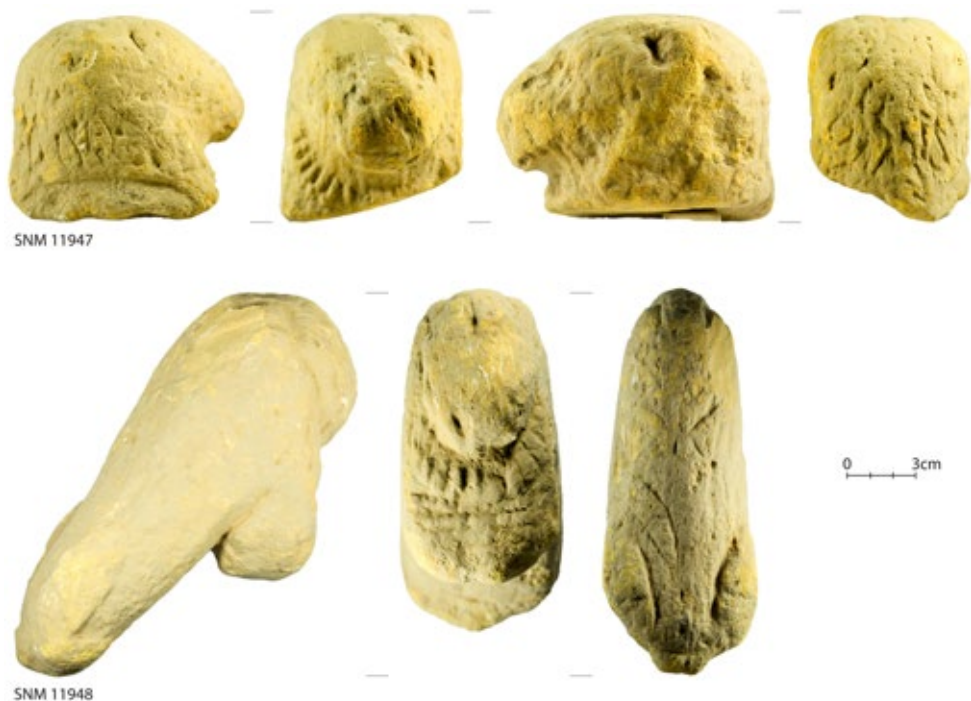
Fig. 5. Statuettes of lions SNM 11947 and SNM 11948.

and is largely abraded. This applies particularly to the ears (the left one is largely missing, the right one is missing altogether) but also to other, less prominent areas. The flat nature of a large area of abraded surface on the forehead indicates that the statuette may have been situated upside down on a floor for a period of time or even intentionally deformed in this manner in the course of ritual practice – a phenomenon well-documented at Naga. 46 Less exposed areas such as the nape and the throat mane show that originally, the modelling of details was rendered in a relatively high relief. The curls of the mane had an organic, natural feel in the back, with growing schematisation towards the sides. Under the chin, the uppermost line of throat mane curls was accentuated by a collar of curls distributed radially in a regular fashion with their tips curling outwards.