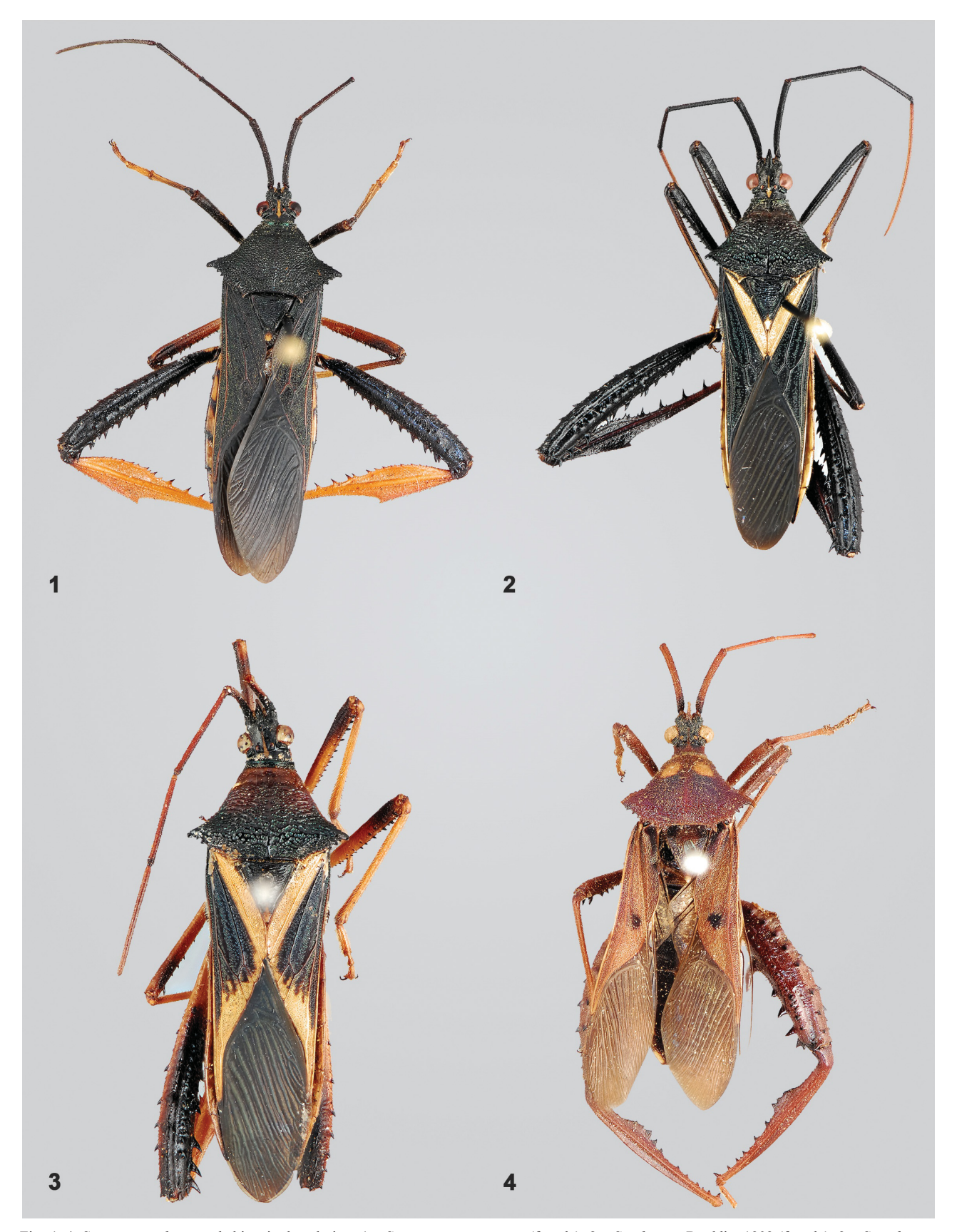
Figs 1–4. Stenometapodus spp., habitus in dorsal view. 1 – S. aurantiacus sp. nov. (female); 2 – S. v-luteum Breddin, 1903 (female); 3 – S. ambiguus Brailovsky, 1984 (female); 4 – S. guttifer (Stål, 1859) (male).

Prosternum deeply concave; meso-, and metasternum not sulcate; metapleural supracoxal spine hard to see in males, absent in females; metathoracic scent gland peritreme with two completely separated auricles. Legs . Male hind