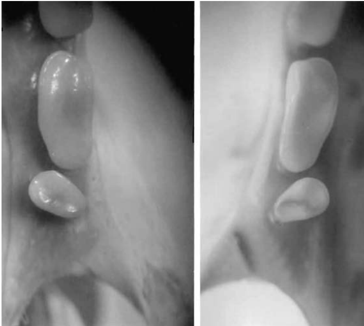
Fig. 3. Epomophorus wahlbergi. Left – Left m^1 and extra m^2 of the abnormal specimen of Fig. 1. Right – Right m^1 and extra m^2 of the abnormal specimen of Fig. 1.

According to our research and bibliographical inquiry, polyodontia has been surely found at least in the cases indicated hereunder; the number of the latter ones, in fact, is to be considered approximate, because either the possible incompleteness of data at our disposal or the unusability of some bibliographical records, e.g. those of a WOŁOSZYN's preliminary contribution (1992; see p. 120), never published in extenso , on dental anomalies in 2 species of Rhinolophidae and 6–7 species of Myotis . Pteropodidae (about 42 genera and 186 species): in 11 genera and 17