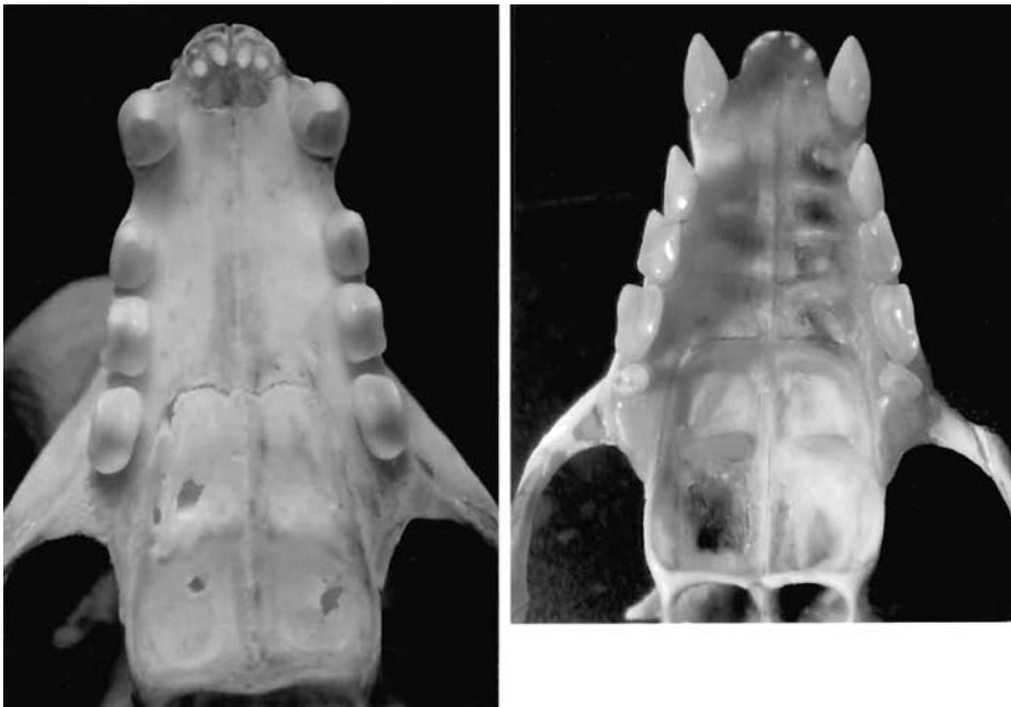
Fig. 1. Epomophorus wahlbergi (photos by B. LANZA). Left – Upper teeth of a normal specimen; young (cranial sutures incompletely obliterated!) adult ♀ MZUF 3013, Alessandra Island (= Touata Id.), 00° 34' N, 42° 46' E, Jubba River, near Jilib (= Gelib), S Somalia, 13 August 1962, «1962 Mission in Somalia of the Florence University». Right – Upper teeth of the abnormal specimen; young (cranial sutures incompletely obliterated!) adult ♂ MZUF 2971, same locality and collecting date.

PHILLIPS (1971; 25 specimens examined) writes: «An adult male (AMNH 97267) from Brazil has an extra tooth anterior to the normal first upper premolar ( p^3 ) on the right side [...] only about 30 per cent the size of p^3 and, unlike the p^3 , has but one root. The crown [...] is high and pointed and has a small notch on the posterior end that fits under and against the anterior cingular style of the p^3 . The extra tooth differs