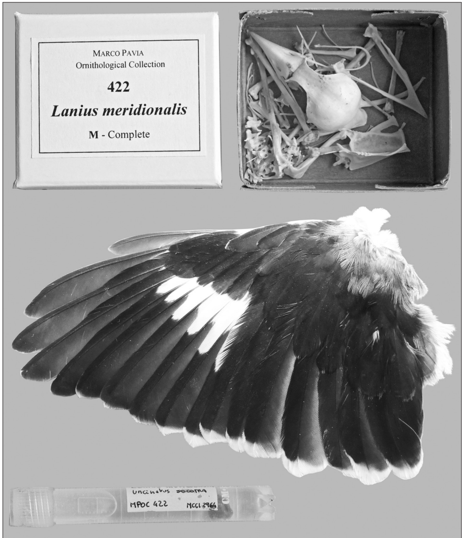
Fig. 2. Specimen of Lanius meridionalis uncinatus from the Socotra Island, Yemen, preserved as a complete skeleton (MGPT-MPOC 422), left stretched wing and tissue sample (MCCI 2964).

Up to now (end of 2013), the MGPT-MPOC collection comprises 944 complete or partial skeletons from 418 species of 22 orders and 94 families (Table 1). The first aim of the collection was to have a best representative of Western Palaeartic species, as it is primarily use as reference for European Pleistocene fossil bird remains. Following the development of the paleornithological researches, with studies on older forms and African birds (e.g. Bedetti & Pavia 2013, Pavia & Mourer-Chauviré 2011), our new purpose is to broaden the collection in order to have at least one specimen from each bird family