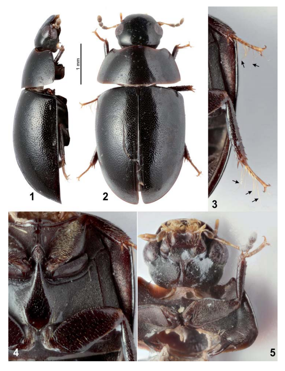
Figs 1–5. Coelostoma (Lachnocoelostoma) thienemanni Orchymont, 1932, specimen from Vietnam: 1) dorsal view, 2) lateral view, 3) meso- and metatarsi with long dorsal swimming hairs, 4) meso- and metaventrite and femora, 5) head, prothorax and prothoracic leg in ventral view.

floating tree trunk] / 15 1 29 [= 15.i.1929] / Exp. Thienemann / [reverse side of the label] (62) FR5c // FR5c 25/1 // Thienemanni / Pas de car. Ventr. / Tarses courts // TYPE'; 2 females (IRSNB): 'SUMATRA Da. Ranaoe / Abfluss: schwimm. Baumstamm [= outlet: floating tree trunk] / 15 1 29 [= 15.i.1929] / Exp. Thienemann / [ventral side of the label] (62) FR5c