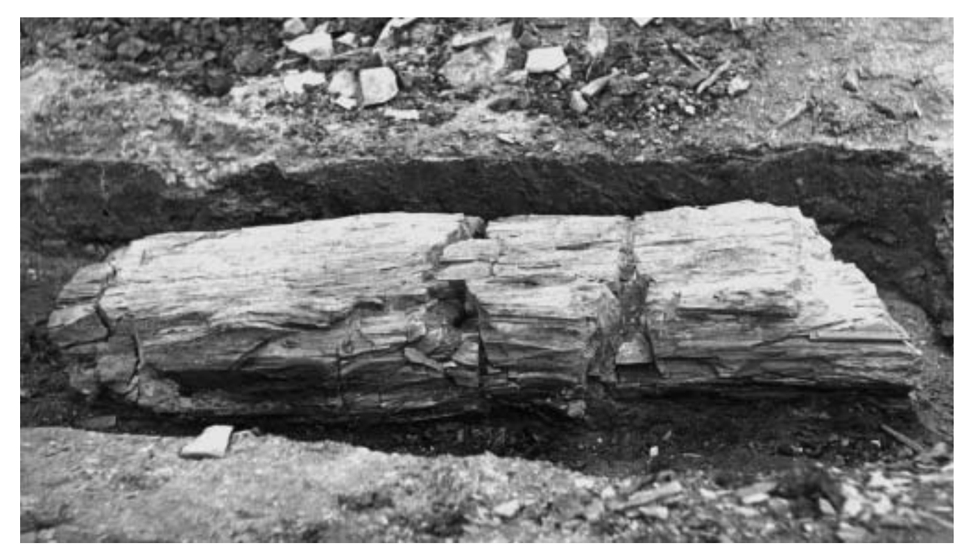
Text-fig. 1. Historical photo by M. Mag of the discovery of the silicified stem in the locality of Kučlín in 1976 (courtesy Regional Museum Teplice).

MARION (Březinová et al. 1994). In 2003, the wood was reinterpreted as Tetraclinoxylon vulcanense PRIVÉ and associated with twigs and seeds of Tetraclinis MASTERS (Sakala 2003). In fact, Doliostrobus and Tetraclinis are the only two conifers described in Kučlín (Kvaček 2002, Kvaček and Teodoridis 2011 in this volume), well characterized and unequivocally separated