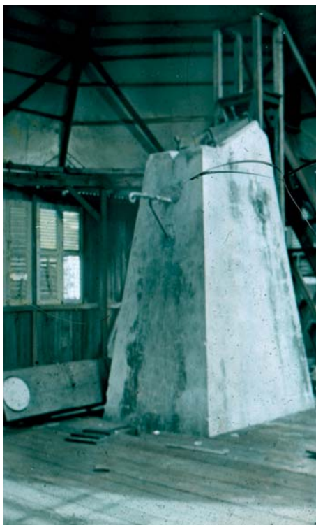
Plate 04 Interior of M. R. Štefánik's abandoned observatory in Tahiti, 1920. Reproduction of a photograph taken by Novák himself. Slide 8.5×8.5cm. NM – NpM, inv. no. AO II 1735