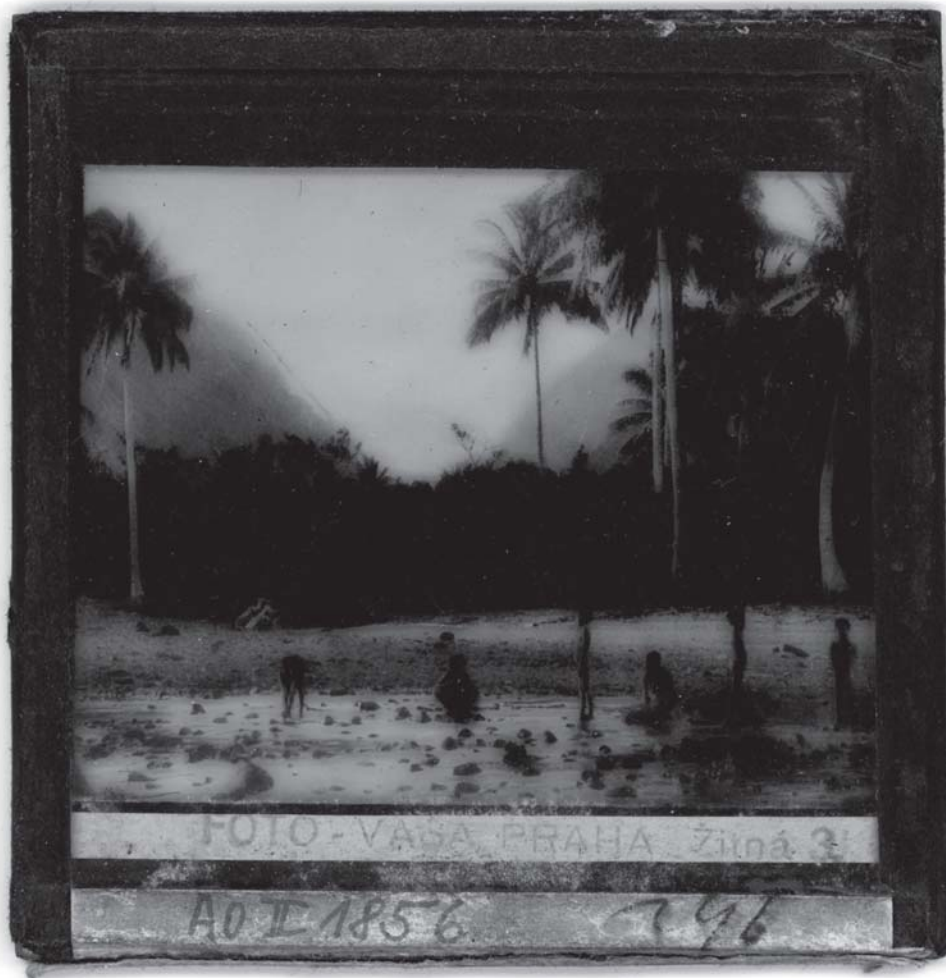
Plate 01 Slide with the preserved stamp of the manufacturer, photographer Václav Váša from Prague. Slide 8.5×8.5cm, NM – NpM, inv. no. AO II 1856

USTOHAL, Vladimír. Tahitská odysea [Tahitian odyssey]. Tišnov: Sursum, 2004 WITTLICH, Filip. Fotografie – přímý svědek?! Fotografický obraz a jeho význam pro historické poznání . [Photography – a direct witness?! The photographic image and its significance for historical research] Prague: Nakladatelství Lidové noviny a Univerzita Karlova v Praze, Filozofická fakulta, 2011