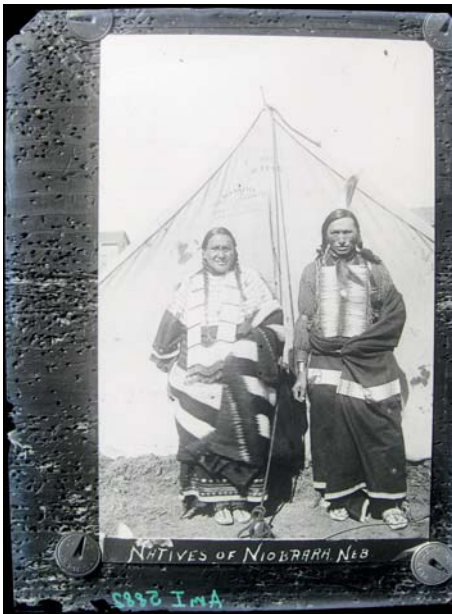
Plate 02 Negative with preserved handwritten note for the colourist (a) and the resulting slide (b). NM – NpM, inv. no. As I 8959 (a) and As II 2780 (b)