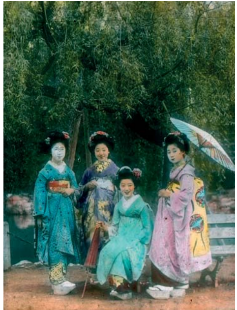
Plate 07 Geisha – negative with reproduction of a postcard and three versions of the hand-coloured slide. NM –NpM, inv. no. As I 8870, As II 3009, As II 3010, As II 3119