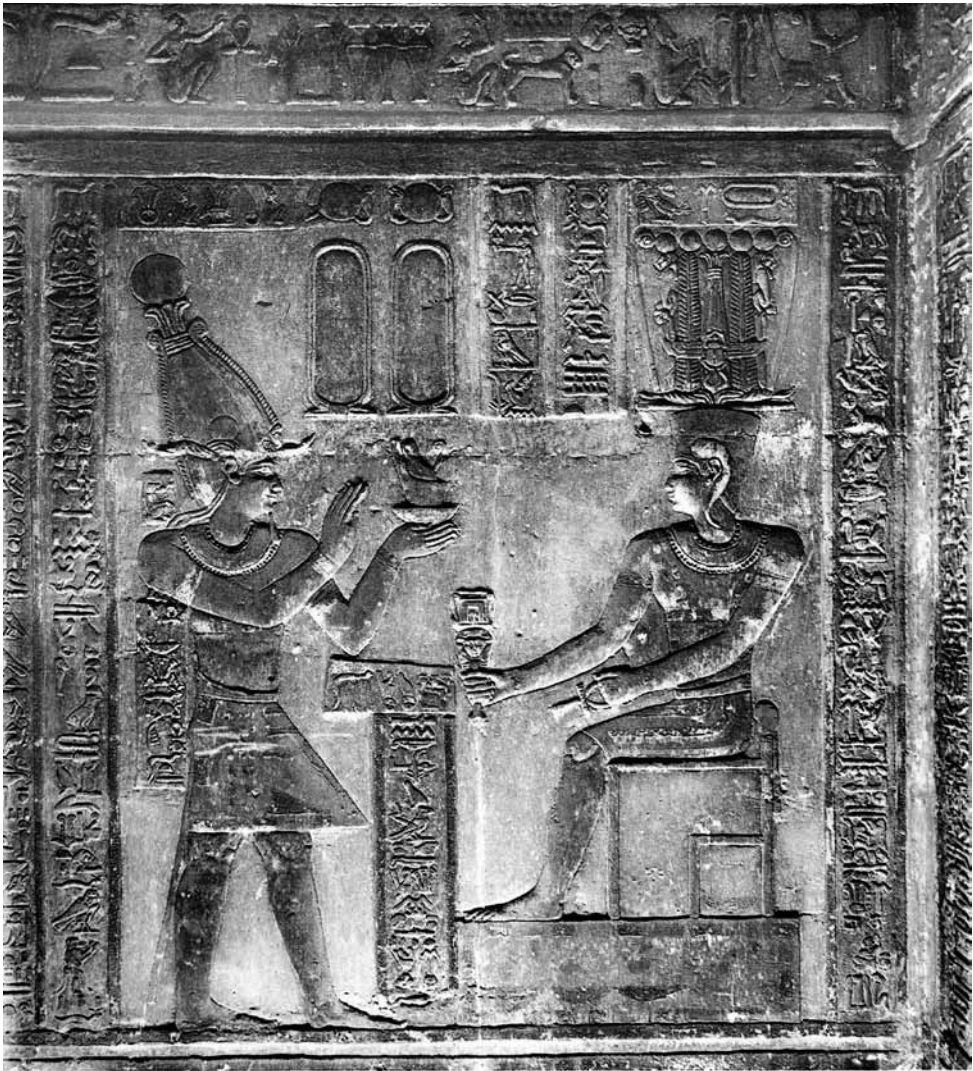
Fig. 4 The child god Ihy wearing the crown of the divine child in Dendera, 1st western room (K), eastern wall (southern corner), 3rd register (from Dendara III: plate CCVI).

ram's horns ( Ovis longipes palaeoegyptiaca ) which rise from a trapeziform arrangement resembling the lower part of the red crown. In addition the crown is often decorated with a winged sun disc or a winged scarab placed in the centre of the bundle, as well as two cow horns wrapped around the sun disc in front of the bundle. Another element that regularly appeared is a staff or a disc (Beinlich – Hallof 2007: 91) between the ram's horns and the trapeziform lower part of the crown. This element did not appear in Philae and the Dodekaschoinos before the late Ptolemaic period. In the majority of the scenes the wearer also had the side lock over his ear. Variations on and additions to this "basic type" are also to be found in various Egyptian temple scenes. In Philae, for example, there are variations that are particularly concise on the Upper Egyptian part of the crown (see below). Instead of the bundle they have a white crown as the core