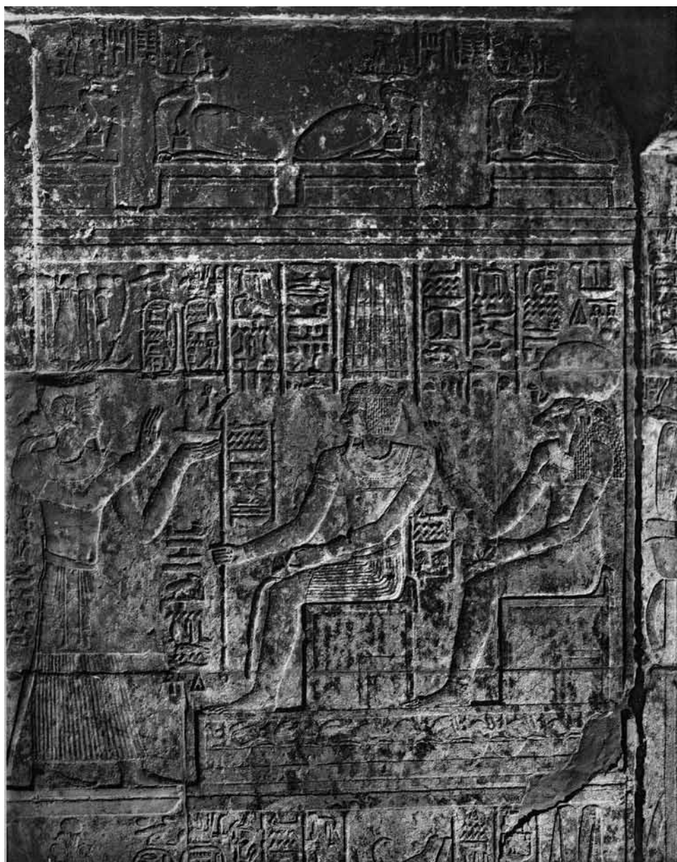
Fig. 2 King Arkamani II performing the offering of Maat in front of Thot of Pnubs and Tefnut; Temple of Dakke, "Chapel" of Arkamani II, inner southern wall, 3rd register, left scene (from Roeder 1930: plate 102).

the reign of Ptolemy VI Philometor (180–164 BCE and 163–145 BCE) (Vassilika 1989: 270). The oldest preserved examples in the Dodekaschoinos on the other hand are the ones from the reign of Arkamani II in Dakka and from the reign of Adikhalamani in Debod. One of the oldest Ptolemaic examples is located in the Temple of Dakka from the reign of Ptolemy VIII Euergetes II (170–163 BCE) (Roeder 1930: 103, pl. 43). Since the