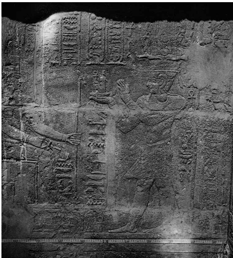
Fig. 3 Kind Adikhalamani performing the offering of Maat in front of Amun of Debod; Temple of Debod, “Chapel” of Adikhalamani, inner western wall, 3rd register, right scene (from Roeder 1911: plate 25).

oldest examples of the crown of the divine child in Philae are from the reign of Ptolemy VI, the kings of Meroe might have taken their inspiration from Karnak or the temple of Edfu in the case of this headdress (for more on this see below).