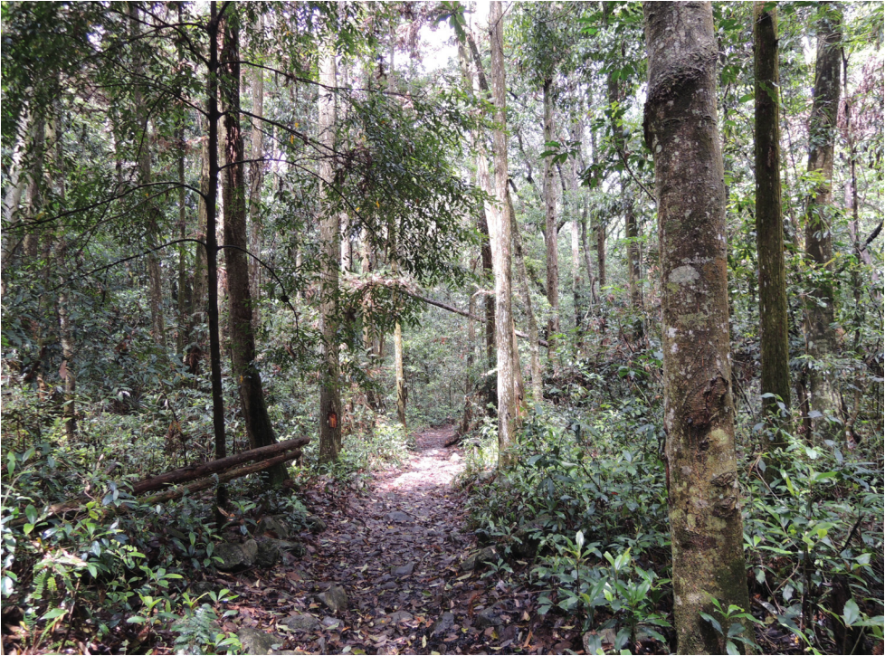
Fig. 8. The habitat of Synchroa formosana sp. nov. at the type locality.