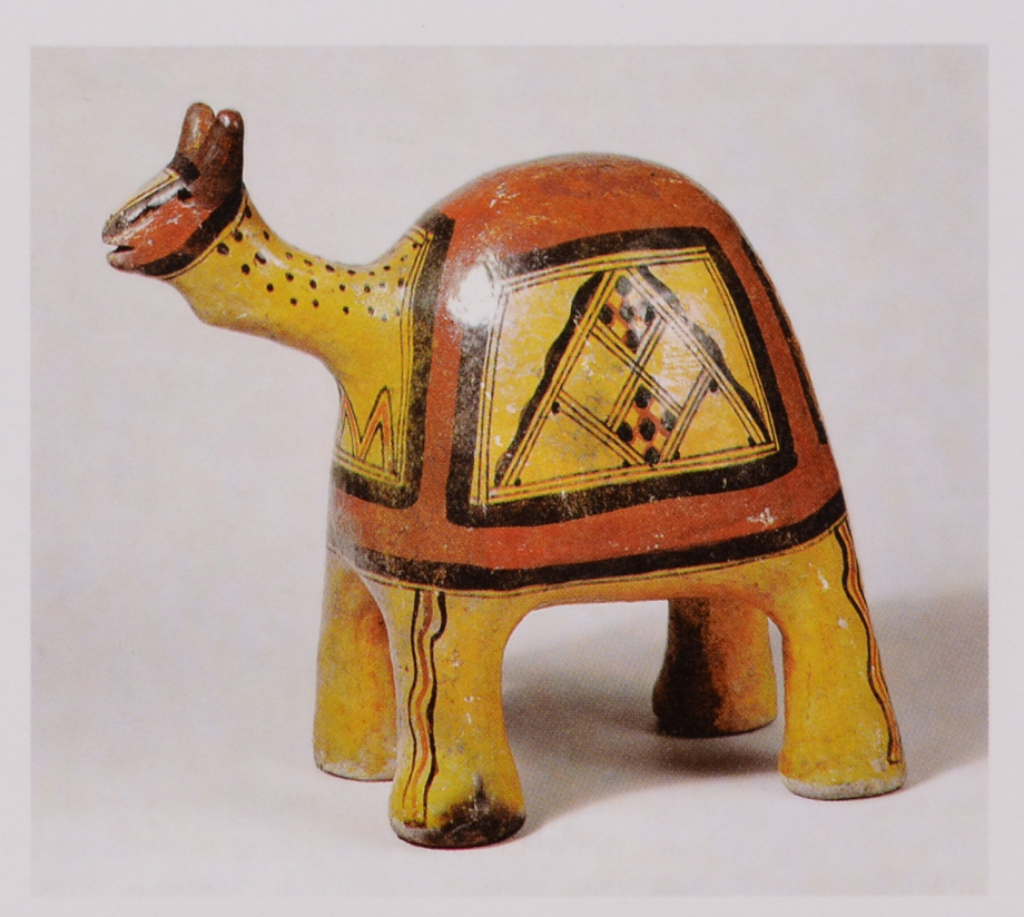
Figure of camel, terracotta, Kabyls, Algeria, before 1939, anonymous owner. H. 20 cm, w. 19.5 cm (NpM 4-56 086).

time by museologists in France and Great Britain; the aim of their action was the achievement of a truly systematic documentation of the individual exotica collections. The then prevailing belief happened to be that in small museums such collections might be subject to peril resulting from lack of qualification, and that locally specialised museum personnel would not be in a position to perform an adequate job in classifying and documenting them. And as specialists in non-European cultures were few, governments (or corresponding ministries) strove to concentrate the collections at a single place. During that period, which ended in 1955, the Náprstek Museum absorbed collections from museums in České Budějovice, Tábor, Hradec Králové, Opava and others. In the process it was revealed that those museums also had valuable, albeit small-scale, collections. Many of them were rather old, having originated before World War I. Those relocated collections consisted predominantly of items coming from east and south-