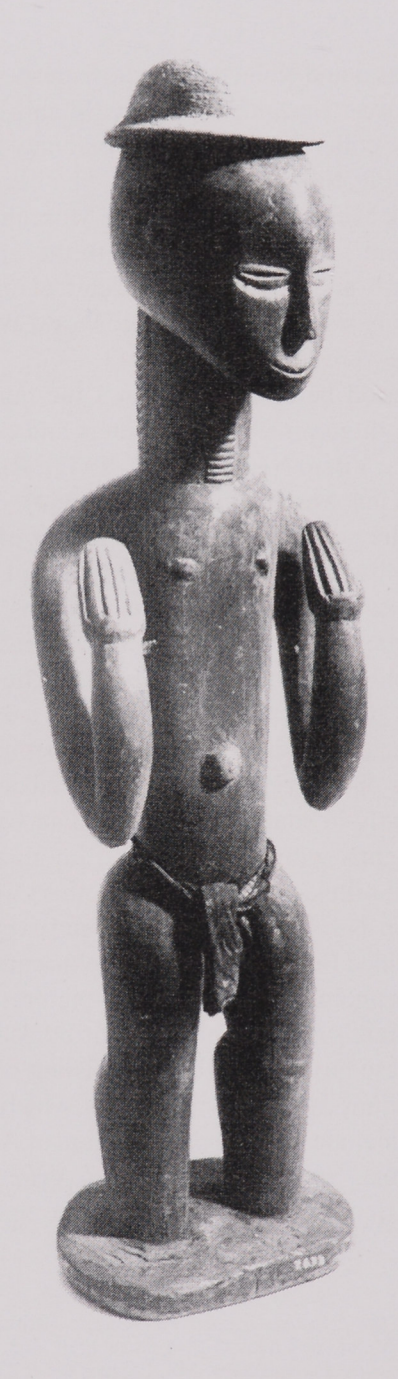
A standing male figure in a tropical helmet, wood, Bete Shien. Yvory Coast, before 1930s, former collection of Vl. Golovin, H. 65 cm (NpM 4-7 633).