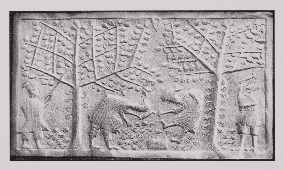
"Cocoa harvest", aluminium panel by Asiru Olatunde, Oshogbo, Nigeria, before 1965, former collection of Uli Beier, a donation arranged by E.Štumpf. 48 x 85 cm (NpM 4-A 6 401).

The history of ethnographers' endeavours in expanding the muse-um's African collections is centred around the 1930s, when the Czecho-slovak state purchased the collection of Pavel Jáchym Schebesta (1887 - 1967) (or in Czech spelling "Šebesta"), covering the territory of north-eastern Zaire. It includes objects coming from the Pygmies, with whom he also dealt in several travel books published in Czech language editions, as well as from their farming neighbours: the Ngala, Nkundu and Mangbetu. Schebesta's collection is the museum's sole body of items from Africa which was built consistently along comparative lines. The rest of the African collections, gathered by others, are "monographic". Another collection that was built by an ethnographer dates from as recently as the 1960s. It was the result of an expedition led by Ladislav Holý (1933 - 1997), to carry out long-term ethnographic research of Sudan's Berti tribe. During one of its stages (1965) his wife, Alice Holá (1932 - 1991), accompanied Holý. Thanks to them, the Náprstek Museum acquired a