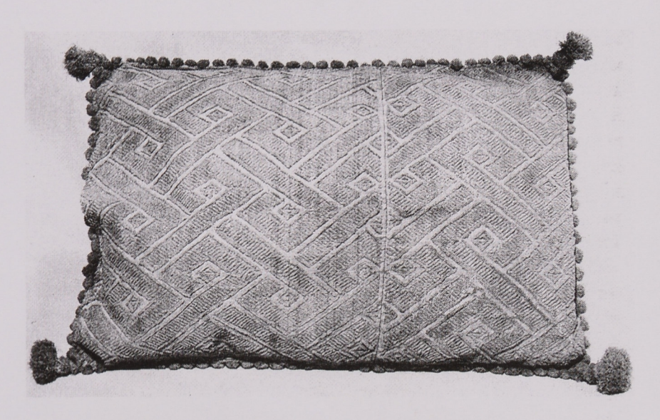
Raphia cushion, so called "Kasai velvet", Teke – Kuba, Kongo, before 1607, former collection of the emperor Rudolf II. 50 x 72 cm (NpM 4-22 258).

east Africa, i.e., from areas which had been visited by tourists since last century, as well as from territories that had been settled by expatriates from this country (including notably today's Kenya and Tanzania) or had received military advisors and experts from the then Austro-Hungarian Empire. Most of them were former German colonies or territories which were in the focus of interest of the German and Austrian governments, such as Cameroon, Togo, Namibia, Tanzania, Egypt and Morocco.