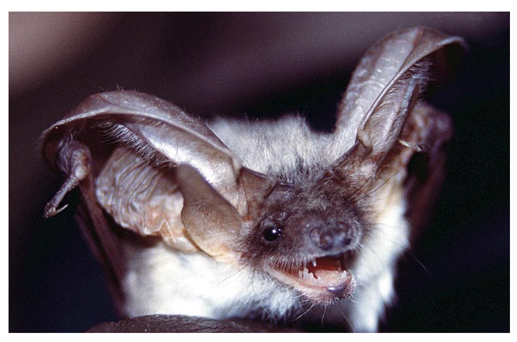
Fig. 2. Plecotus macrobullaris from the area of Qafëmal, northern Albania (K. SACHANOWICZ). Rys. 2. Plecotus macrobullaris z okolic Qafëmal w północnej Albanii (K. SACHANOWICZ).

may contradict the statement that in P. macrobullaris the forearm length decreases towards the west (SPITZENBERGER et al. 2003), suggesting rather different pattern of geographical variation – with smaller individuals in central part of the range and larger in its marginal parts. However, larger samples for morphometric and molecular studies are required to solve the problem of external variation and differences in skull measurements (SPITZENBERGER et al. 2003, 2006) among populations of P. macrobullaris from different parts of its range.