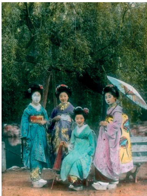
Plate 07 Geisha – negative with reproduction of a postcard and three versions of the hand-coloured slide. NM –NpM, inv. no. As I 8870, As II 3009, As II 3010, As II 3119