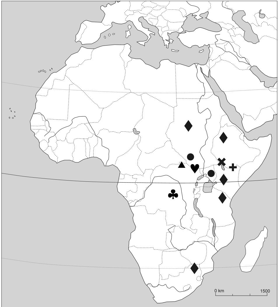
Fig. 27. Distribution of Afrorabigus species: Afrorabigus basilewskyi (●), Afrorabigus robusticornis (◆), Afrorabigus belingaensis (○), Afrorabigus toumodiensis (□), Afrorabigus kolweziensis (♣), Afrorabigus tropheus (+), Afrorabigus manikaensis (▲), Afrorabigus uromastyx (×), Afrorabigus muscicola (♥).

Coloration. Head black, pronotum, scutellum and elytra dark brown, maxillary, labial palpi and mandibles brown, antennomeres 1-2 and 11 brown-yellow, remaining