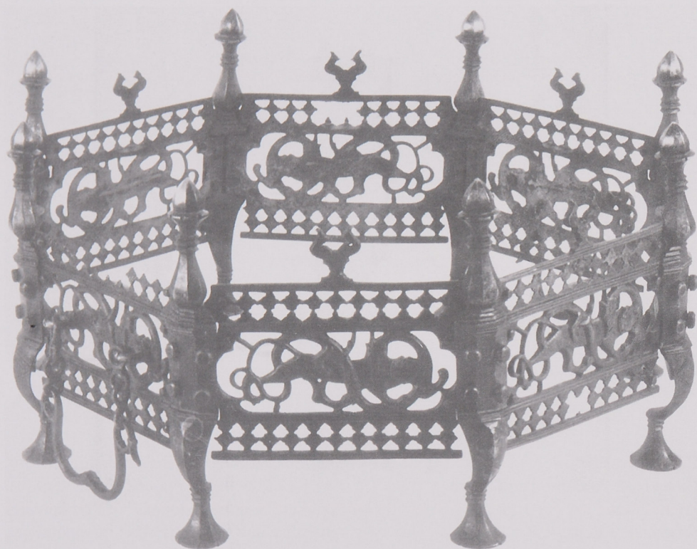
Pl. 1. Brazier

Braziers intended for roasting birds, as well as the closely related objects like incense burners, belonged to the equipment of royal households as presented on e.g. an unfinished painting from Herat of the 15 th century depicting the king's servants in the garden 3 . But it was utilized also for other purposes. The perched bud-shaped finials „actually perform the function of conducting the heat to the tray resting upon them“ 4 . During cool days it kept water in bottles on the tray warm. The open-work cast of these objects permitted the escape of smoke. Sometimes it is difficult to differ incense burner from brazier because their function was very similar. Incense burners were cast in one or in pieces and even though comparable in shape with braziers but they were usually smaller in size. The shape of braziers or related object like incense burners resemble some elements of Islamic architecture, especially tombs. Various individual details of the brazier under the description also have their parallels in the architecture. The rows of merlons above and below the main ornament resemble one of the typical motive we can see in architecture, ceramics and metalworks in Iran and India as well. Festoons of trilobed cusped lotus-shaped flowers belonged to the regular design vocabulary of architecture and decorative art objects in Deccan, in the South Indian sultanates where the Iranian influence was strong.