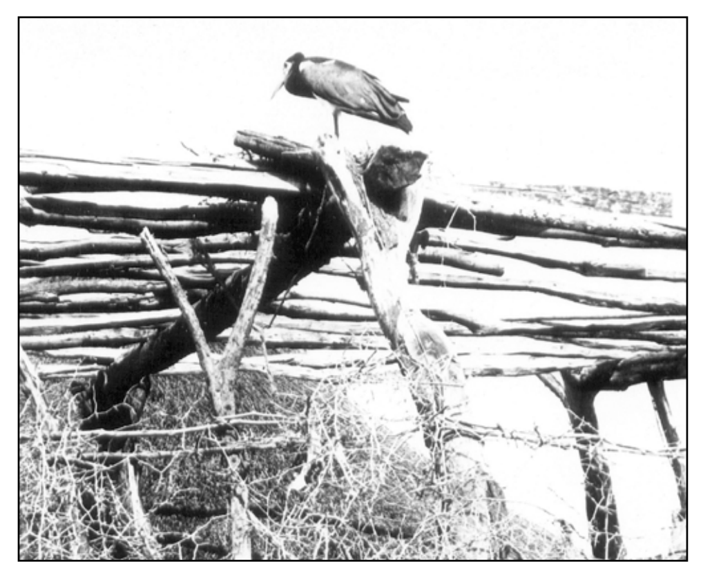
Fig. 1. Abdim's stork sitting on a wooden construction, Sudan, 1920s, Náprstek Museum, Af I 2706.

A number of stork mummies were discovered there, including those of white storks, black storks, Abdim's storks, and open-billed storks.<sup>11</sup>