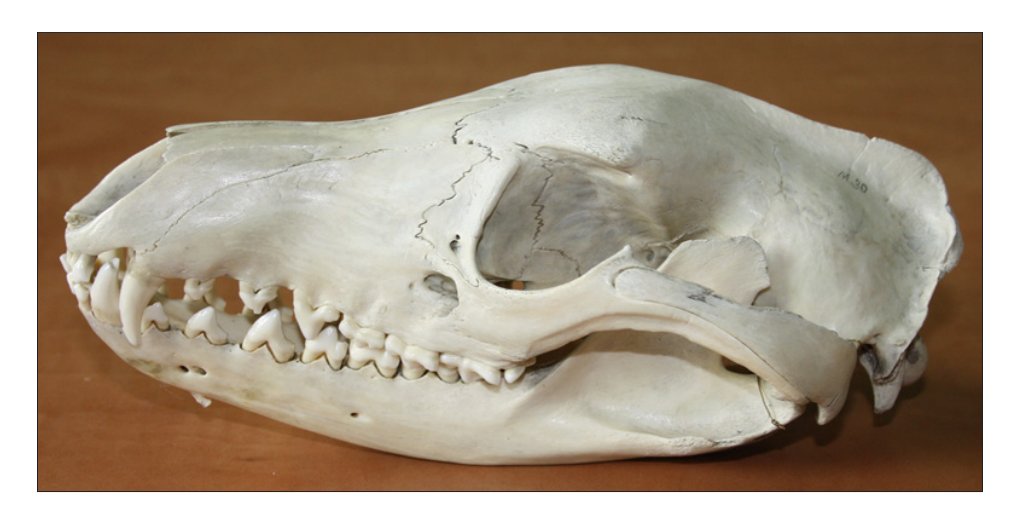
Fig 3. Skull of thylacine, Zoological Museum Protivín (unnumbered).