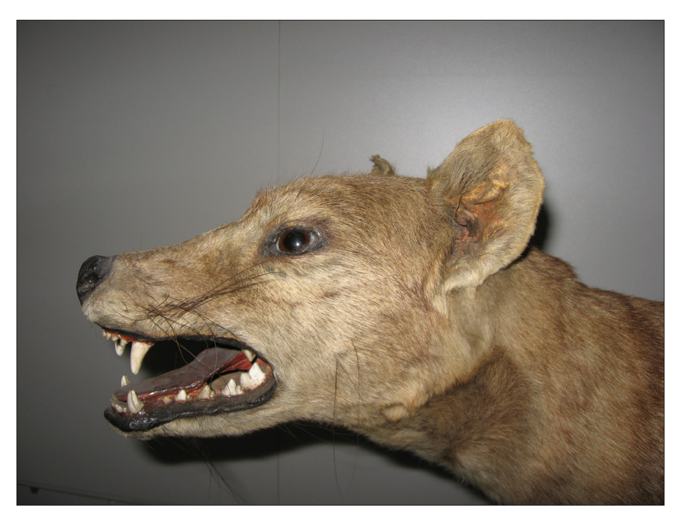
Fig. 2. Mounted specimen of thylacine (detail of head), National Museum, Prague (NMP P6V-010667).

ity: Van Diemen's Land (= the name formerly used for the island of Tasmania), locality unknown (Heráň 1966).