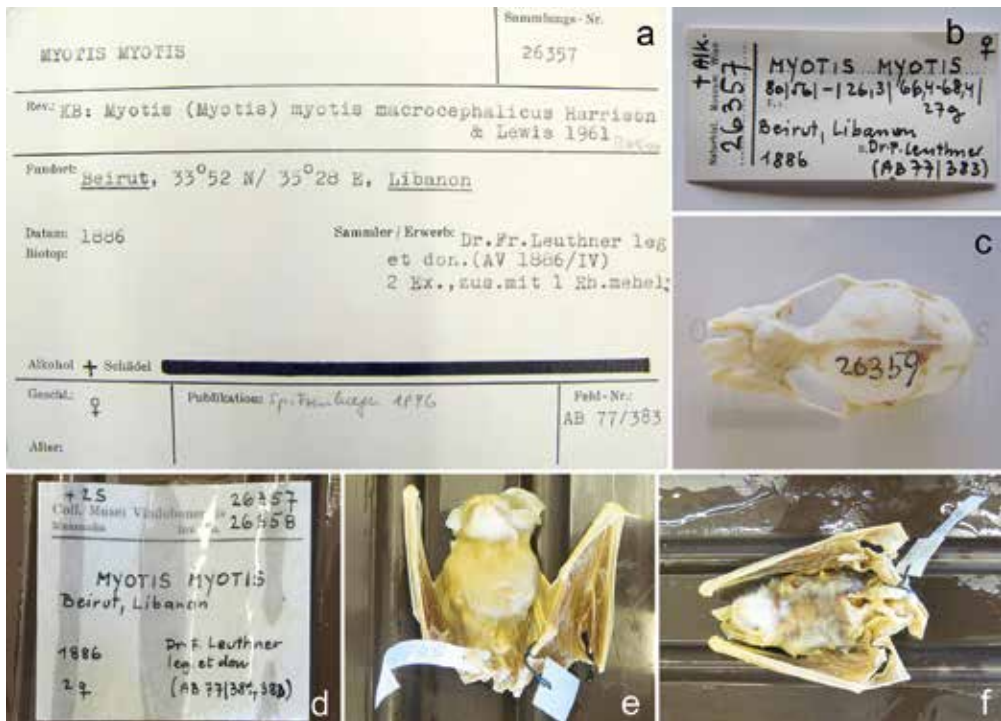
Fig. 6. A selection of items and evidence of the entry 1886/IV. a, b, d, f – Myotis myotis (NMW 26357, 26358); c, e – Rhinolophus mehelyi (NMW 26359). a – card of the modern card index (NMW 26357); b – skull label (NMW 26357); c – complete skull, dorsal aspect; d – label of the alcohol specimens; e – alcohol specimen; f – alcohol specimen (NMW 26358).

Obr. 6. Výběr sbírkových položek a dokumentace přírůstkového čísla 1886/IV. a, b, d, f – Myotis myotis (NMW 26357, 26358); c, e – Rhinolophus mehelyi (NMW 26359). a – lístek současného lístkového katalogu (NMW 26357); b – sbírkový lístek lebky (NMW 26357); c – úplná lebka, hřbetní pohled; d – sbírkový lístek lihových jedinců; e – lihový jedinec; f – lihový jedinec (NMW 26358).