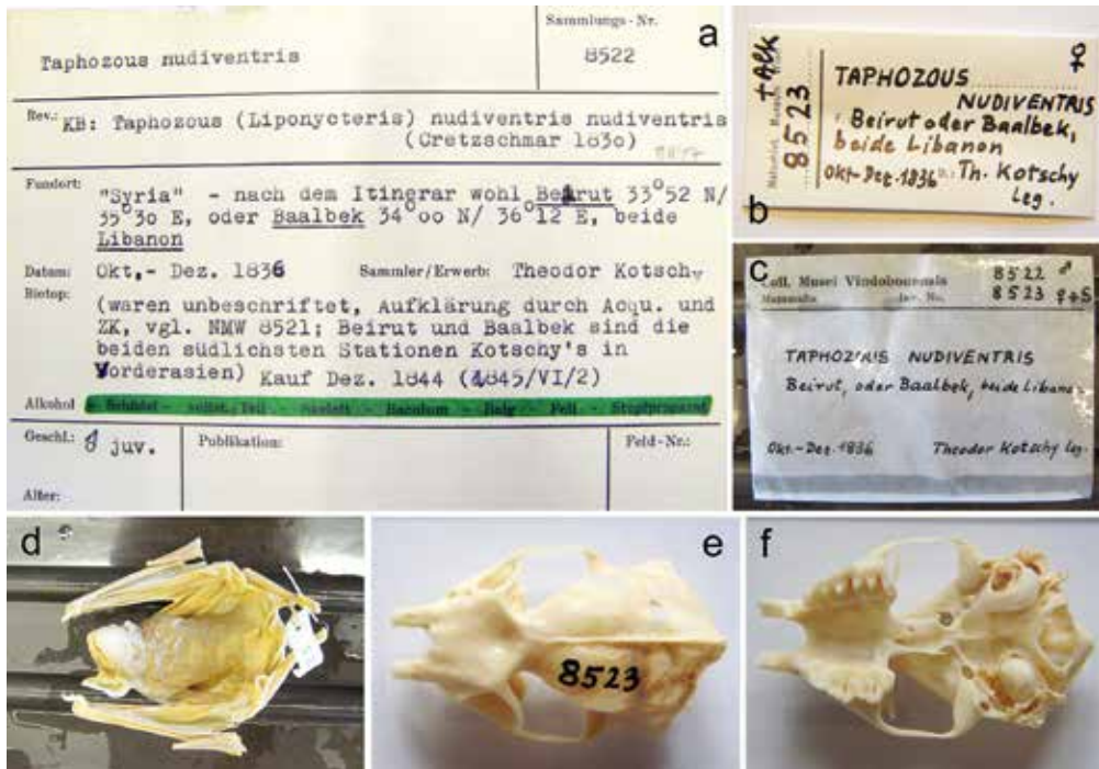
Fig. 4. A selection of items and evidence attributed to the entry 1845/VI/2, Taphozous nudiventris (NMW 8522, 8523). a – card of the modern card index (NMW 8522); b – skull label (NMW 8523); c – label of the alcohol specimens; d – alcohol specimen (NMW 8522); e – complete skull, dorsal aspect (NMW 8523); f – complete skull, ventral aspect (NMW 8523).

Obr. 4. Výběr sbírkových položek a dokumentace přiřazené k přírůstkovému číslu 1845/VI/2, Taphozous nudiventris (NMW 8522, 8523). a – lístek současného lístkového katalogu (NMW 8522); b – sbírkový lístek lebky (NMW 8523); c – sbírkový lístek lihových jedinců; d – lihový jedinec (NMW 8522); e – úplná lebka, hřbetní pohled (NMW 8523); f – úplná lebka, břišní pohled (NMW 8523).