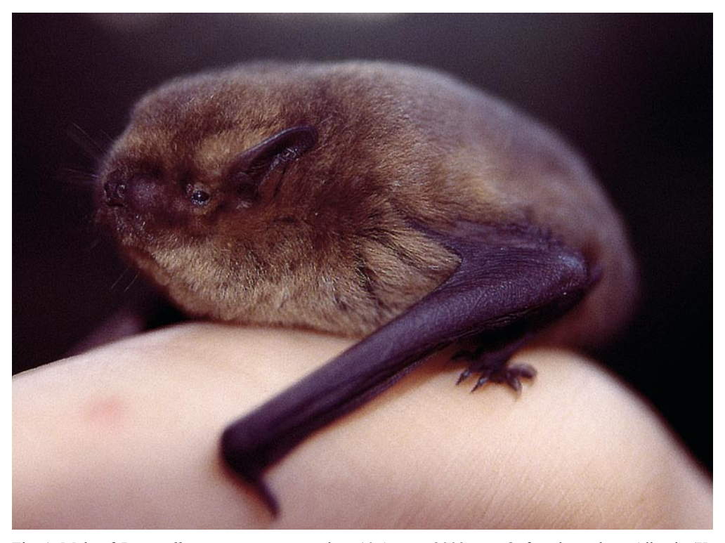
Fig. 1. Male of Pipistrellus pygmaeus captured on 10 August 2003 near Qafèmal, northern Albania (K. Sachanowicz).

Rys. 1. Samiec Pipistrellus pygmaeus odłowiony 10 sierpnia 2003 w pobliżu Qafëmal w północnej Albanii (K. Sachanowicz).