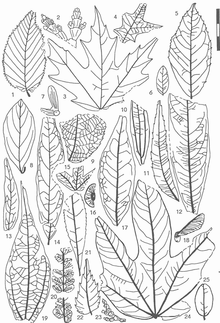
Text-fig. 4. Floral picture of the site Suletice-Berand. 1 - Carpinus grandis Unger, MMG SuBe 25b, 2 - Tetraclinis salicornioides (Unger) Kvaček, MMG SuBe 254, 3 - Acer palaeosaccharinum Stur, MMG SuBe 759a, 4 - „ Quercus “ cruciata A. Braun, MMG SuBe 26:1 (see Engelhardt 1898, pl. 1, fig. 27), 5 - Icaciniophyllum artocarpites (Ettingsh.) Kvaček et Bůžek, MMG SuBe 1a, 6 - Leguminosae gen. et sp. indet. (forma 2), MMG SuBe 15, 7 - Engelhardia macroptera (Brongn.) Unger, MMG SuBe 263, 8 - Cornus studeri Heer, MMG SuBe 147, 9 - Carya serrifolia (Goepf.) Kräusel, MMG SuBe 102b, 10 - Daphnogene cinnamomifolia (Brongn.) Unger (forma „ lanceolata “), MMG SuBe 42a, 11 - Engelhardia orsbergensis (Wessel et Weber) Jähnichen, Mai et Walther, MMG SuBe 805a, 12 - Magnolia sp., MMG SuBe 119:1, 13 - Laurophyllum cf. medimontanum Bůžek, Holý et Kvaček, SuBe 201c, 14 - Laurophyllum cf. acutimontanum Mai, MMG SuBe 133b, 15 - Acer cf. decipiens A. Braun sensu Walther, MMG SuBe 825:2, 16 - Craigia brononii (Unger) Kvaček, Bůžek et Manchester, MMG SuBe 466, 17 - Dicotylophyllum maii Bůžek, Holý et Kvaček, MMG SuBe 174b, 18 - Acer sp., MMG SuBe 269a, 19 - Daphnogene cinnamomifolia (Brongn.) Unger (forma „ cinnamomifolia “), MMG SuBe 76, 20 - Pronephrium stiriacum (Unger) Knobloch et Kvaček, MMG SuBe 189:1a, 21 - Platanus neptuni (Ettingsh.) Bůžek, Holý et Kvaček, MMG SuBe 392a, 22 - Zelkova zelkovifolia (Unger) Bůžek et Kotlaba, MMG SuBe 20a, 23 - „ Libocedrus “ suleticensis Brabenec, MMG SuBe 762a, 24 - Dombeyopsis sp., MMG SuBe 658, 25 - Leguminosae gen. et sp. indet. (forma 3), MMG SuBe 113a. (scale bar = 3 cm)