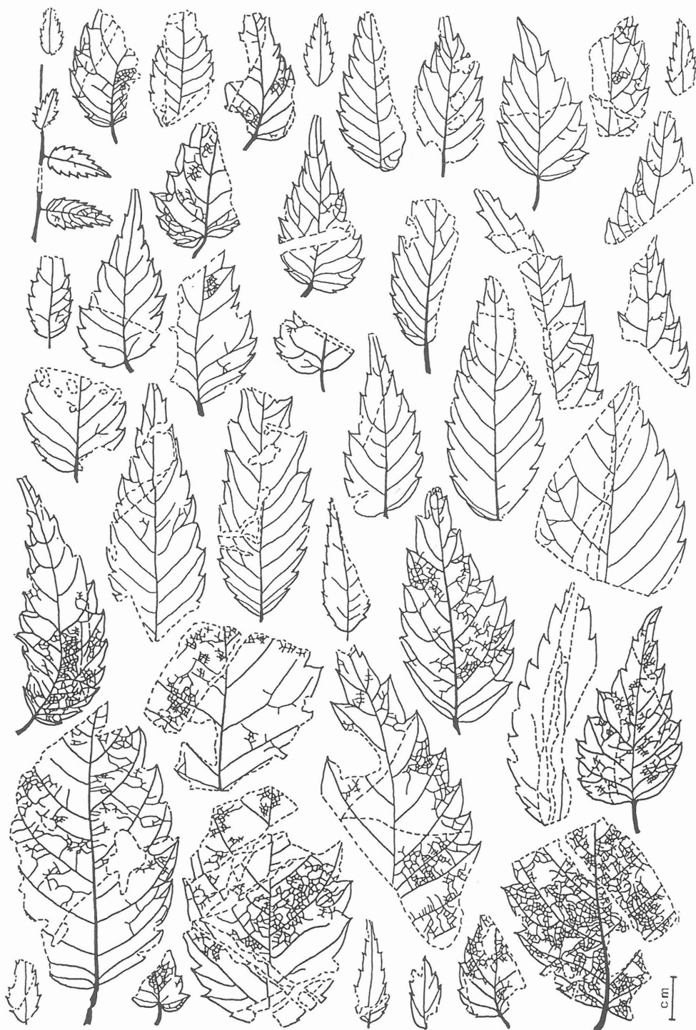
Text-fig. 3. Zelkova zelkovifolia (Ung.) Bůžek et Kotlaba, Suletice-Berand, leaf form variation (scale bar = 1 cm)