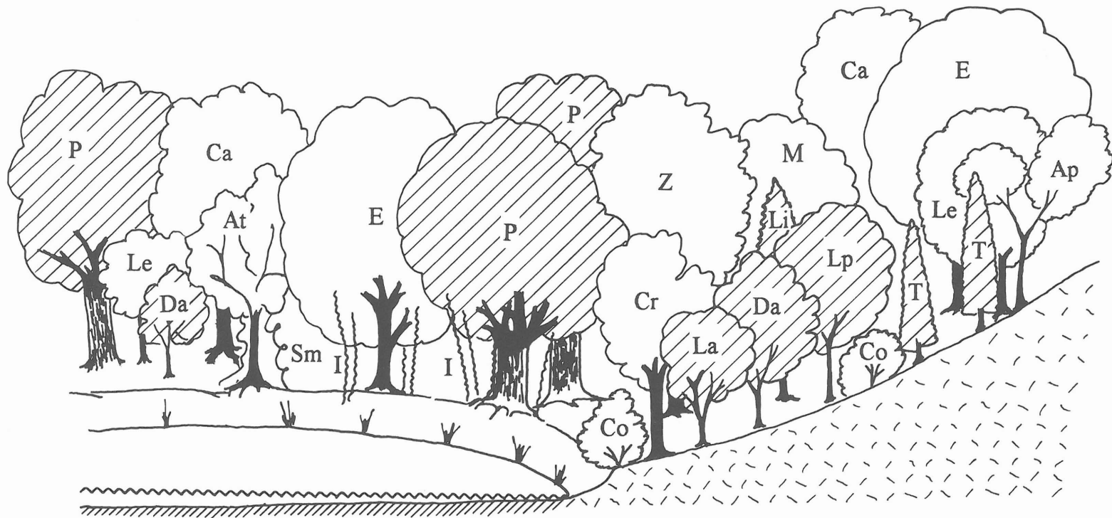
Text-fig. 5. Reconstruction of the Oligocene plant cover at Suletice-Berand (Ap - Acer palaeosaccharinum , At - Acer tricuspidatum , Ca - Carya serrifolia , Co - Cornus studeri , Cr - Craigia bronnii , Da - Daphnogene cinnamomifolia , E - Engelhardia orsbergensis/macroptera , I - Icaciniophyllum artocarpites , La - Laurophyllum cf. acutumontanum , Le - Leguminosae gen. et sp. indet., Li - „ Libocedrus “ suleticensis , Lp - Laurophyllum cf. pseudoprinceps , M - Magnolia sp., P - Platanus neptuni , T - Tetraclinis salicornioides , Z - Zelkova zelkovifolia . Hatched trees were evergreen. For substrate see explanation in text-fig. 2