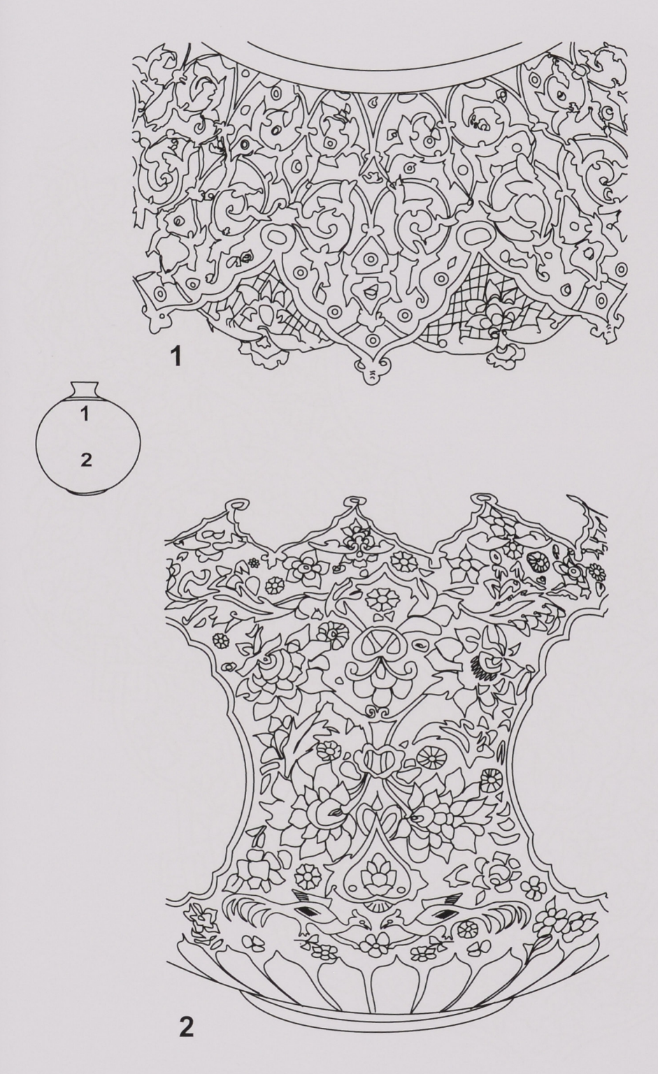
Fig. 8: Drawing. Detail of decoration of the water vessel in question.