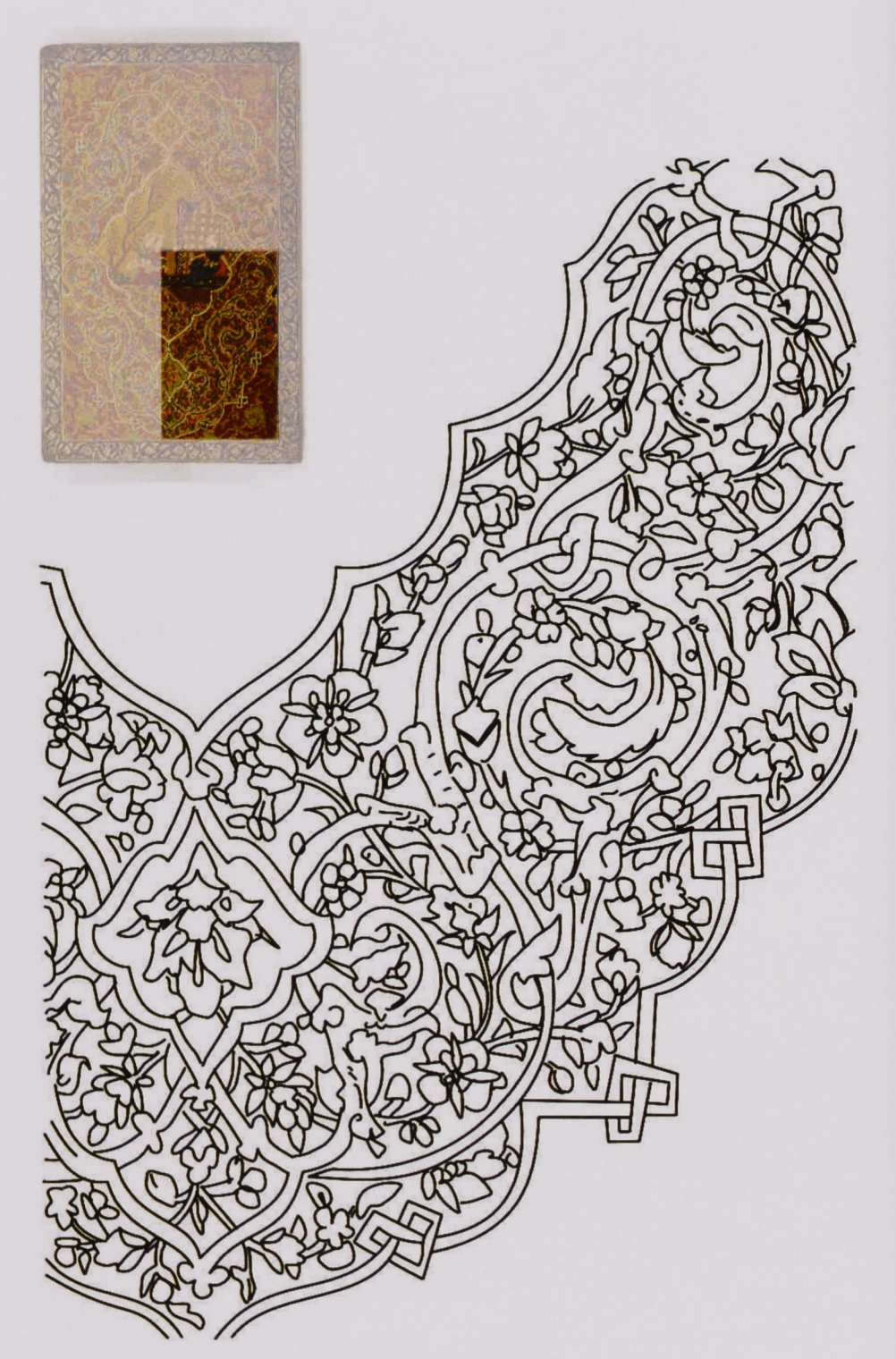
Fig. 9: Drawing. Detail of decoration of Safavid book cover.