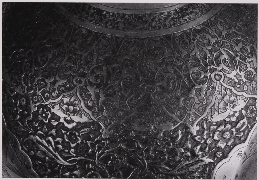
Fig. 6 a, b: Detail of decoration of the water vessel in question.