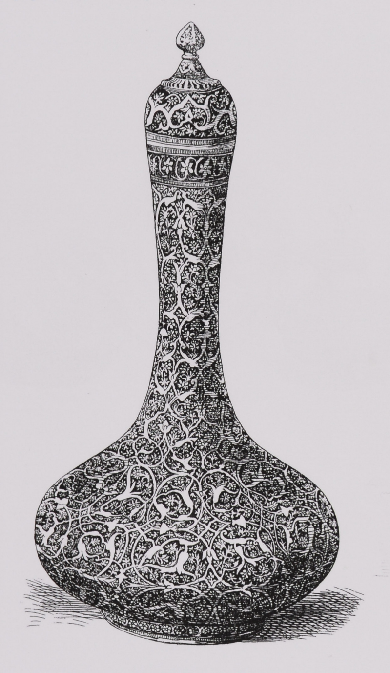
Fig. 11: Muslim ewer.