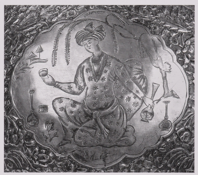
Fig. 2: Detail. Medallion with a nobleman.