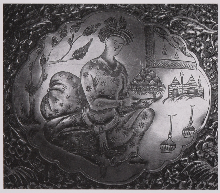
Fig. 5: Detail. Medallion with a servant.