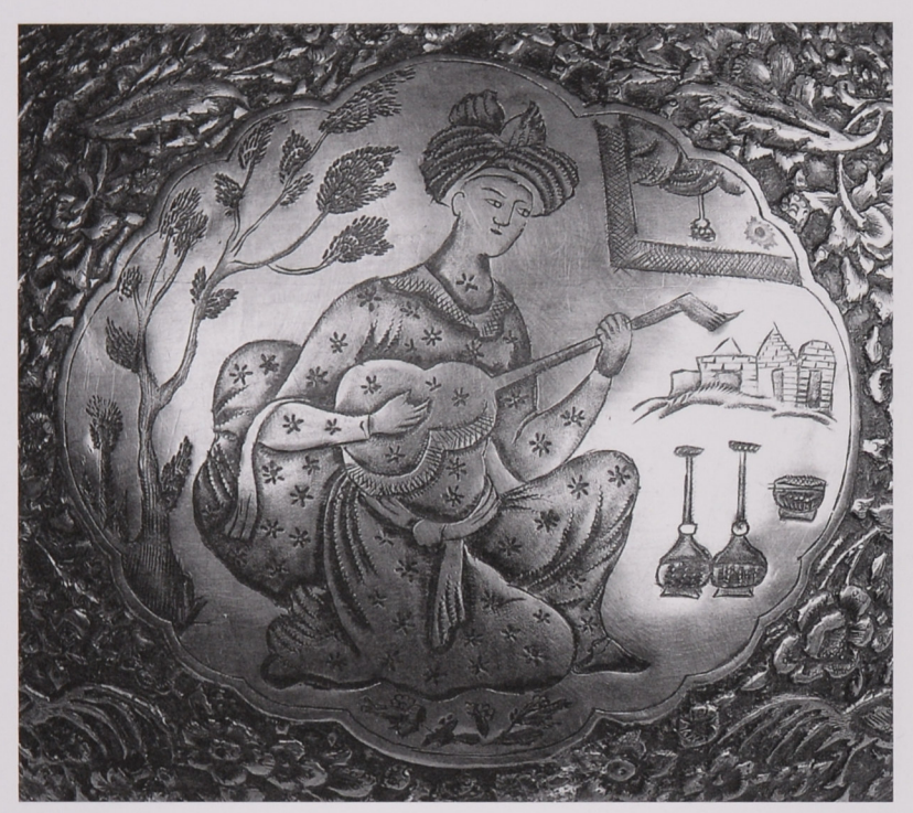
Fig. 4: Detail. Medallion with a male musician.