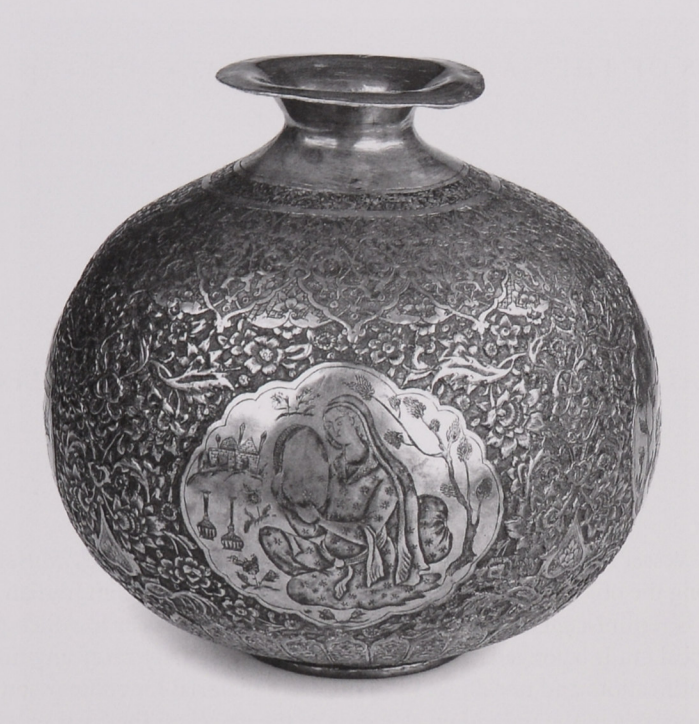
Fig. 1: Vessel. India, Kashmir or Punjab, beginning of 19<sup>th</sup> century. Brass; beat work, chased, engraved, black composition/lac on cross-hatched ground. H. 18.6 cm, diam. of body 18.1 cm, diam. of stand 8.2 cm. National Museum–Náprstek Museum, 16 273.<sup>3</sup>

While studying and publishing articles on Indian metal objects<sup>4</sup> over the last ten years, I have come across a large number of items in collections and publications regarding metal vessels (see bibliography), but I was nevertheless unable to find a comparable vessel. This led me to decide to carry out a closer analysis of the individual elements on the basis of which I might come to a conclusion or create a hypothesis, which could be put forward for further specialist evaluation.