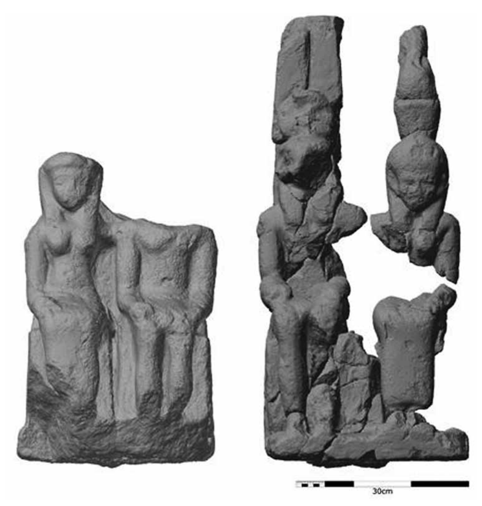
Pl. 4 Visualisation of the pair statues of Amun and Mut found in the Typhonium; to scale (Illustration by Alexander Gatzsche).

unguentarium made of green glass (of the form Isings 82 B2), a piece of perforated copper sheet, the handle and floral (?) decoration of a bronze vessel and a pierced circular faience object of unknown function.