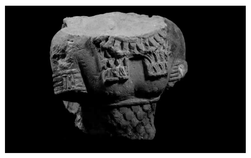
Pl. 5 Fragment of the statue of Apedemak discovered in the "cachette" in the main sanctuary of the Typhonium.