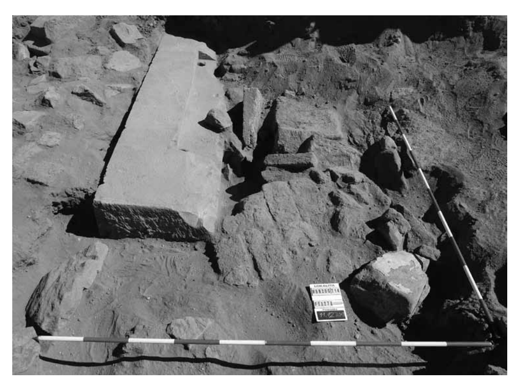
Pl. 3 The archaeological situation in the main sanctuary with the position of the pair statue of Amun and Mut.

the final sign of a toponym included in an epithet of a god (a determinative of a foreign land = h3s.t) and probably refers to the god's role as the protector of the kingdom, while the following part of the inscription stresses his creative powers. Such three-dimensional representations of the god Apedemak are very rare, one example being a fragment of statue kept in the collections of the Louvre museums (AE, E 11157B; Baud 2010: 196, cat. no. 255), another possibly a fragment of a lion's head from Meroe (Näser 2004: 264–265).