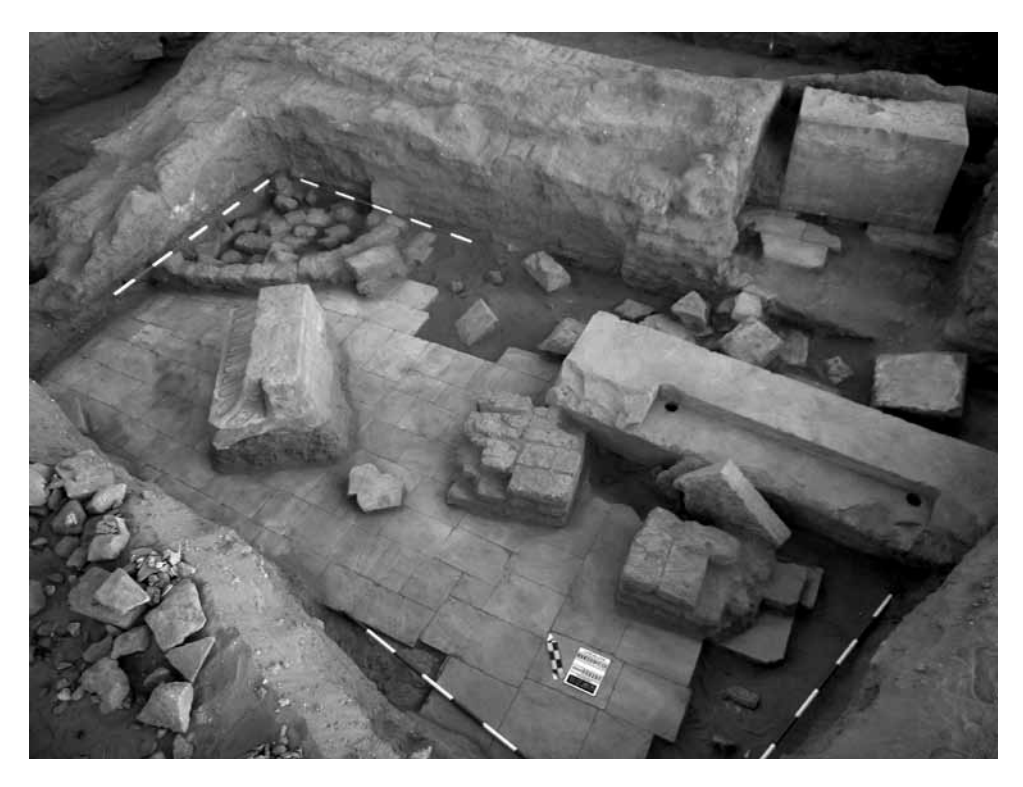
Pl. 1 The north western part of the main sanctuary showing the "cachette" in the corner of the room, block with cornice, large architrave block with fixings for doorjambs, and the altar set in a niche in the wall (Photo by Vlastimil Vrtal).

within the main sanctuary yielded further fragments of wall paintings, including a crown with two uraei wearing the atef or hemhem and double crowns, respectively.