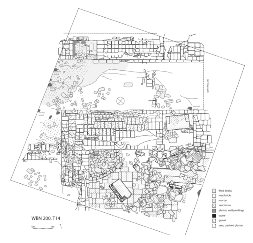
Fig. 2 The archaeological situation in the square T14; walls and the floor level in dark ink (Illustration by Vlastimil Vrtal).

of the walls. The motifs identified so far include water plants growing in the Nile marshes, in the lowest register of the wall's decoration, which is topped by a yellow band. A number of small finds come from the corridor, inter alia a weight and a glass bead.