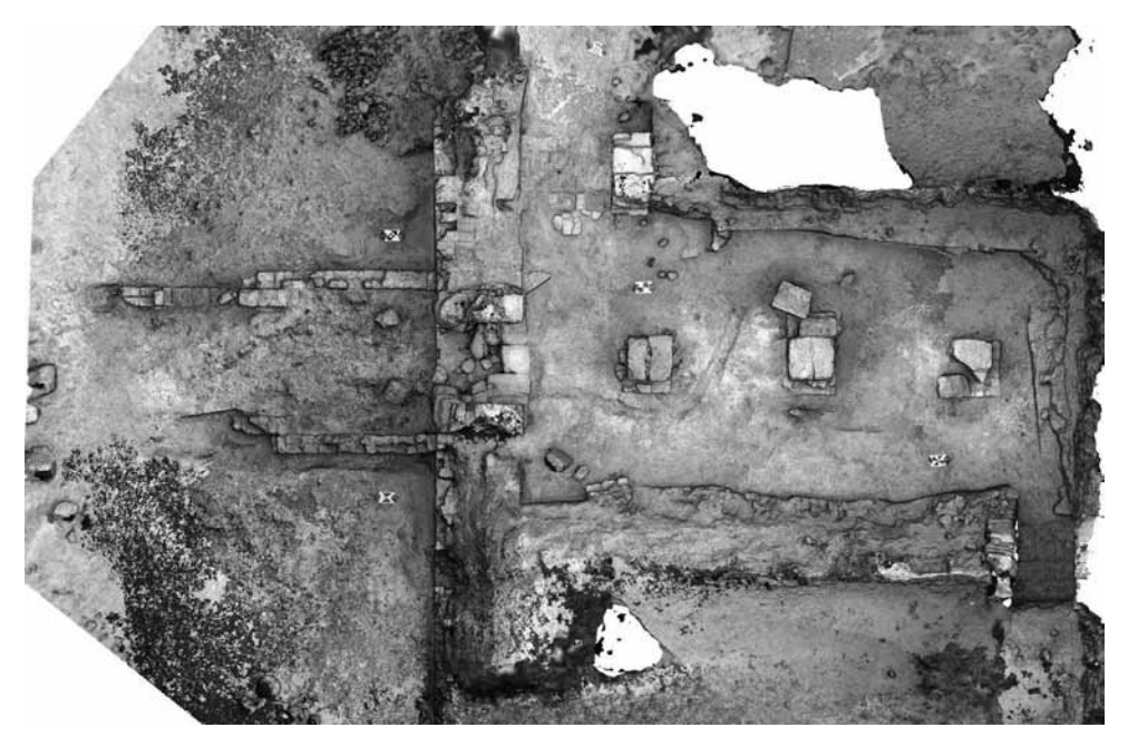
Pl. 8 Archaeological situation in the western entrance to the Palace of Queen Amanishakheto (WBN 158) recorded by means of the stereoscopic method (Illustration by Alexander Gatzsche).

The archeological situations in the squares excavated during the season were documented, together with the progress of excavations, using the stereoscopic method (Structure from Motion). The acquired data were set into images from previous seasons providing a detailed 3D-visualization of the excavated parts of the Typhonium.