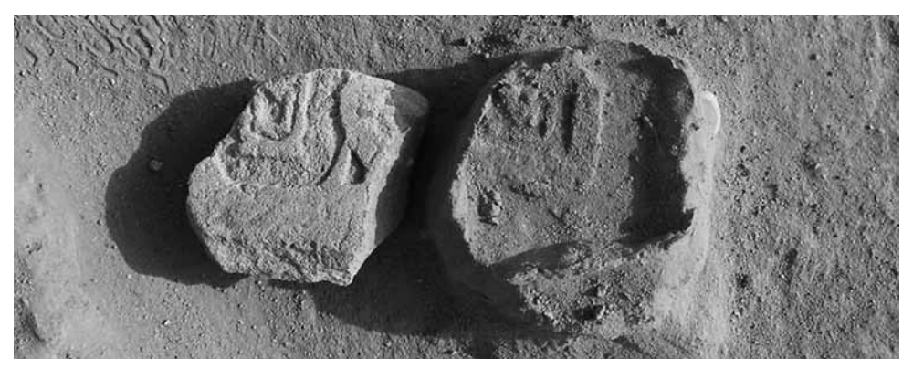
Pl. 7 Fragment of Lepsius' Altar B with depiction of Queen Amanitore and inscription with her name (Photo by Alexander Gatzsche).

the space east of the wall seems to have been fully or partly roofed. This area also differs from the west of the wall by the presence of a floor made of hard-packed crushed sandstone. The wall gradually disappears towards the south, where there is a small modernday wadi. The finds there include several offering balls, fragments of a bark stand (possibly Altar B which was recorded by the Lepsius expedition and parts of which were discovered during the fourth excavation season; Priese 1984; Onderka 2013a; Onderka 2013b), potsherds (including some fine ware), etc. The top layer has been intruded upon by modern building material from the construction and reconstructions of the railway line. A layer of ash is absent to the west of the wall, where a number of postholes were located. These are located mostly in front of the doorway, which possibly indicates the existence of a kind of a shelter or corridor-like structure constructed of light materials and built in front of the door. Another cluster of postholes surrounds a rectangular structure of an unknown character, but paralleled in T9, in the northwest corner of the square. The last group of postholes is located in the southeast corner of the square. Close to the middle of the square's western edge, in the unroofed areas, a vessel was found set into the floor. It likely served as a cooking pot.