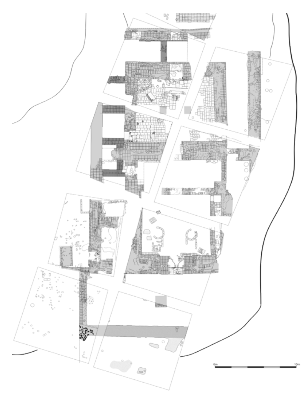
Fig. 1 Current state of the exploration of the Typhonium (Illustration by Vlastimil Vrtal).

The debris that filled the corridor contained numerous fragments of bricks, potsherds (including several almost complete bowls dated preliminarily to the period ca. 50–150 CE), as well as pieces of plaster still carrying wall paintings. The latter were found almost exclusively in the upper strata of the debris. Their motifs were limited to a frieze with stars. Several large fragments of plaster were found still in\ situ on the lower parts