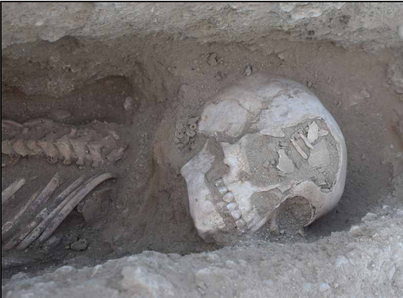
Pl. 2. Ostrich-eggshell beads in burial WBN C271.