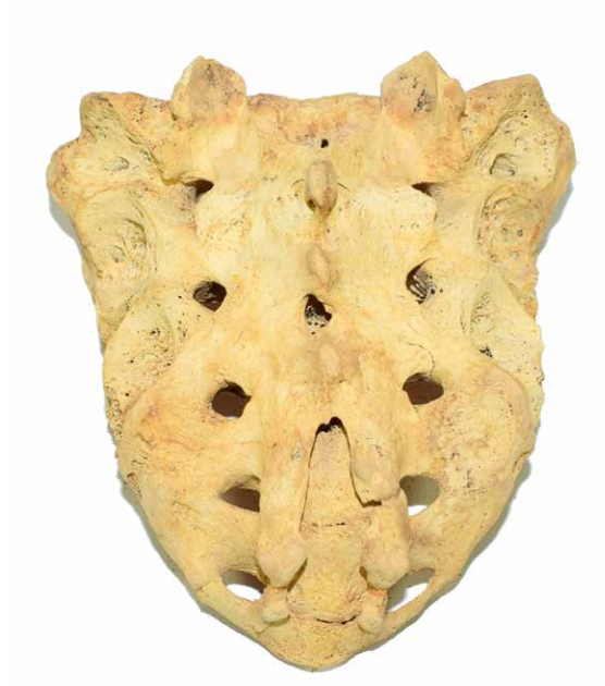
Pl. 3. Spina bifida occulta, individual C264.