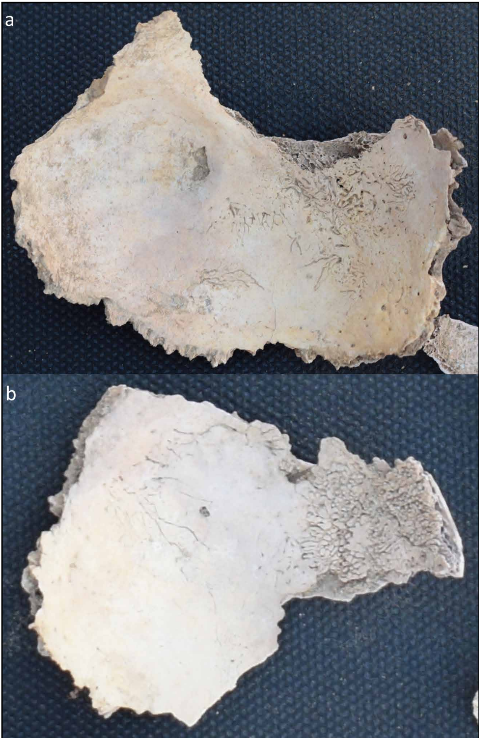
Pl. 5. Endocranial lesions SES in individual C271 showing (a) typical maze-like branching and (b) hair-on-end appearance.