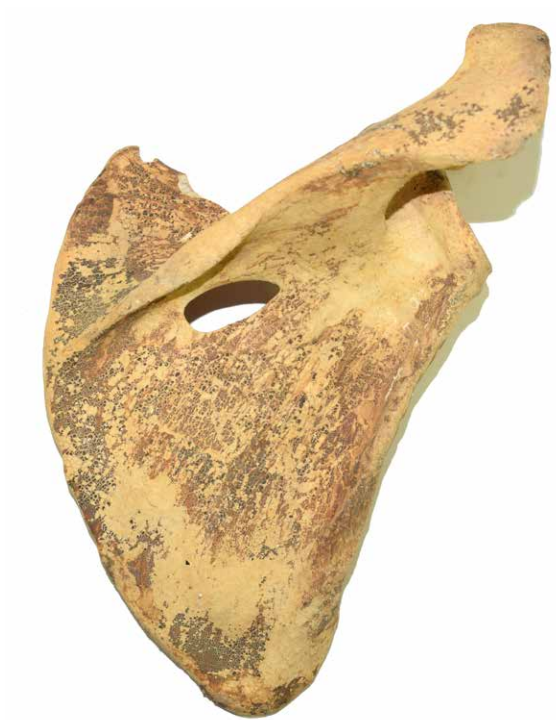
Pl. 4. Defect in ossification in right scapula, individual C265.