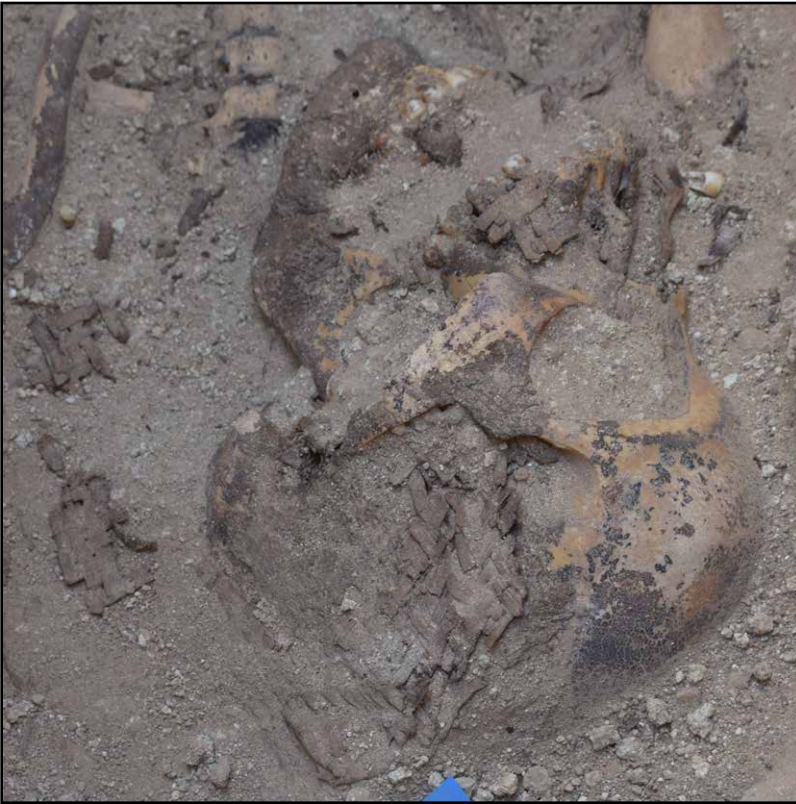
Pl. 1. Preserved remains of textile (over the jaw) and mat in burial WBN C265.