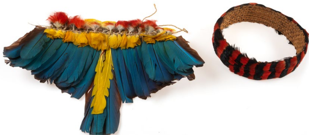
Pl. 13. Feather ornaments of the Yameo ethnic group. From left: Inv. Nos. A7006, A7028.