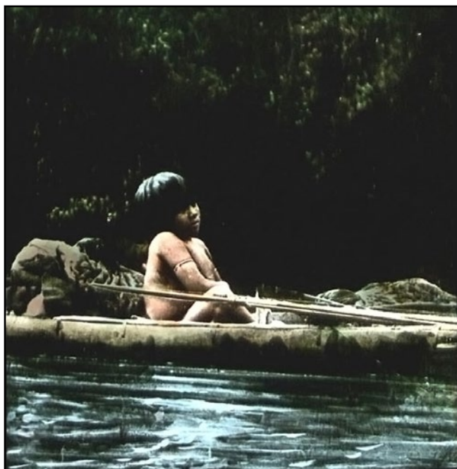
Fig. 12. Boy in a boat on the Orinoco River. NpM, Ethnographic Photographic Collection, Inv. No. Am II 3234.

which have survived in our collections, and a comb (Inv. No. 56620), originally also decorated with feathers, originate. 105 Unfortunately, the archival sources for the objects mostly mention both variants of the Adzanene and Carutana.