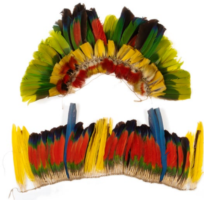
Pl. 12. Feather ornaments of the Kichwa ethnic group. From top: Inv. Nos. 45488, A7027.