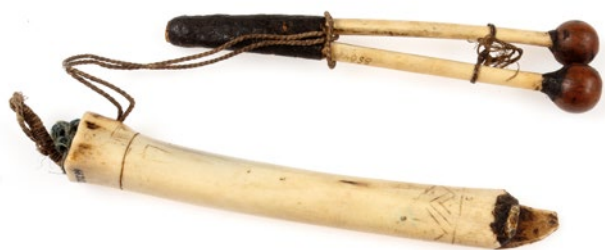
Pl. 1. Ethnographic artefacts and feather ornaments of the Guahibo ethnic group. From top: Inv. Nos. A7005, 66212, (Photo: Jiří Vaněk).