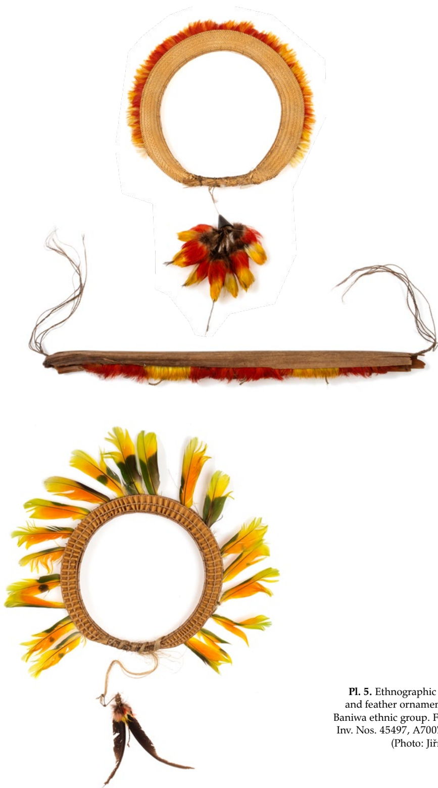
Pl. 5. Ethnographic artefacts and feather ornaments of the Baniwa ethnic group. From top: Inv. Nos. 45497, A7007, A7002.