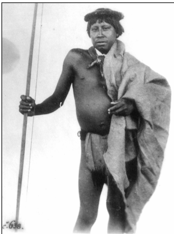
Fig. 10. Guahibo man with a cover made of beaten lychee called marima . NpM, Ethnographic Photographic Collection, Inv. No. Am I 3357.

The Vráz Amazonian collection preserves Guahibo feather ornaments (Inv. Nos. A7001, A7005, and A7004) and a snuffbox for the hallucinogenic powder ñopo , originally also decorated with a bird feather ornament (Inv. No. 66212).