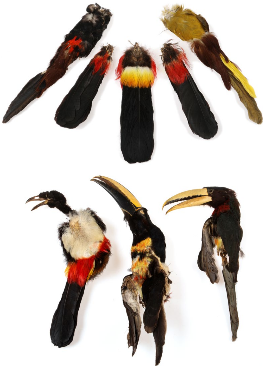
Pl. 16. Examples of feather ornaments from birds without any certain identified ethnicity. Top row from left Inv. Nos. 63912, 63974, 63966, 63973, 63965, bottom row from left: Inv. Nos. 63916, 63969, 63971.