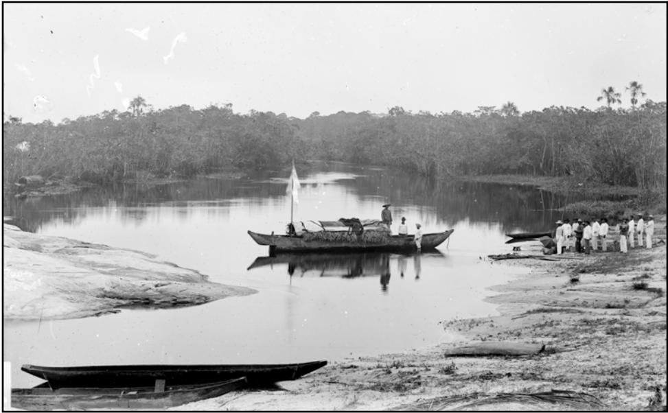
Fig. 7. Vráz's canoe Praga loaded with cargo, moored in San Antonio de Yavita. NpM, Ethnographic Photographic Collection, Inv. No. Am I 6080.

Since Vráz's plan from the beginning was to collect, prepare, and preserve 53 birds and feather ornaments on site, the equipment for this work can be found in his inventory of the cargo he took on the voyage, which lists several chemicals and taxidermy tools for this purpose. 54 To prevent heat and humidity from deteriorating the artifacts, he tried to preserve them as soon as he acquired them, often under a homemade shelter. 55 In connection with the treatment of the bird skins, Vráz mentions that he filled them with 'dry, elastic, air-permeable material, which the hunter often had to bring from afar.' 56 He also mentions that he rubbed the feathers on both sides with arsenic soap, sprinkled them with naphthalene, 57 and salt and alum powder. 58 In order to prevent the feathers from becoming infested with mould or rot, he would unfold them and hang them in open areas in the hut or, in the worst case, in the sun; here he took care to fold them frequently, taking care to prevent 'the greatest enemies of the collector – the ants.' 59