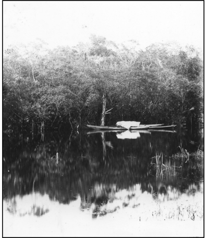
Fig. 4. Vráz's later lost canoe Tucuso on the Orinoco River. NpM, Ethnographic Photographic Collection, Inv. No. Am I 3078.

another shipment to Europe, most of it consisting of natural objects, 12 and continued further west to the foothills of the Andes. With the help of Indigenous guides, he crossed mountain passes of the Andes and finally arrived in November 1893 at Pascamayo, a Peruvian village on the Pacific coast. 13