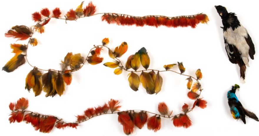
Pl. 7. Feather ornaments for musical instruments from the San Antonio de Yavita community. From left: Inv. Nos. 45737, 63951, 63921.