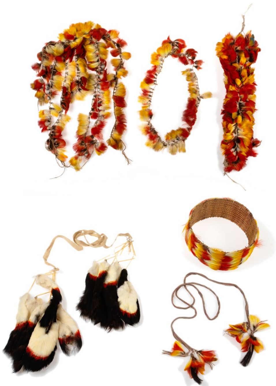
Pl. 11. Feather ornaments of the Kichwa ethnic group. From left: Inv. Nos. 45535, A7018, A7019; A7091, 63955, A7011.