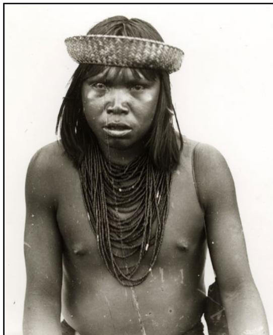
Fig. 9. Guahibo man with wicker headdress into which bird feathers were inserted. NpM, Ethnographic Photographic Collection, Inv. No. Am I 3080.