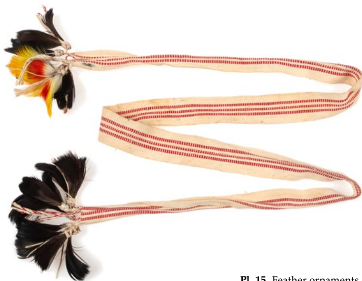
Pl. 15. Feather ornaments of the Maijuna ethnic group. Inv. No. 45429.