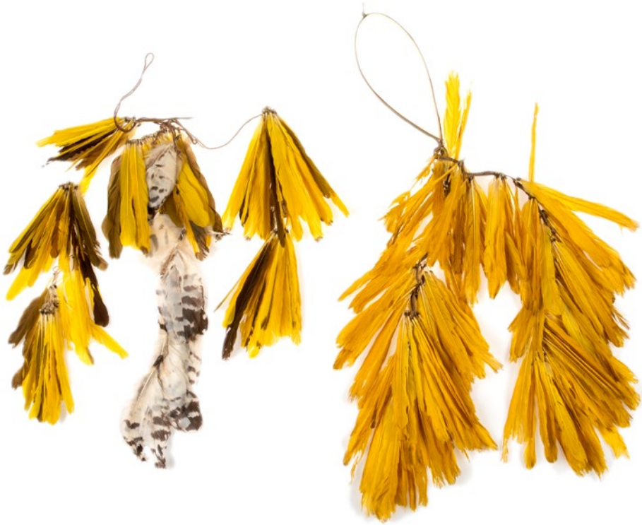
Pl. 10. Ethnographic entities and feather ornaments of the Campas ethnic group. From left: Inv. Nos. 63946, 63945.