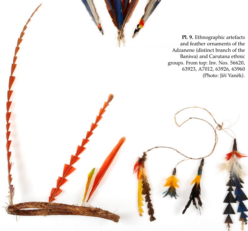
Pl. 9. Ethnographic artefacts and feather ornaments of the Adzanene (distinct branch of the Baniwa) and Carutana ethnic groups. From top: Inv. Nos. 56620, 63923, A7012, 63926, 63960.