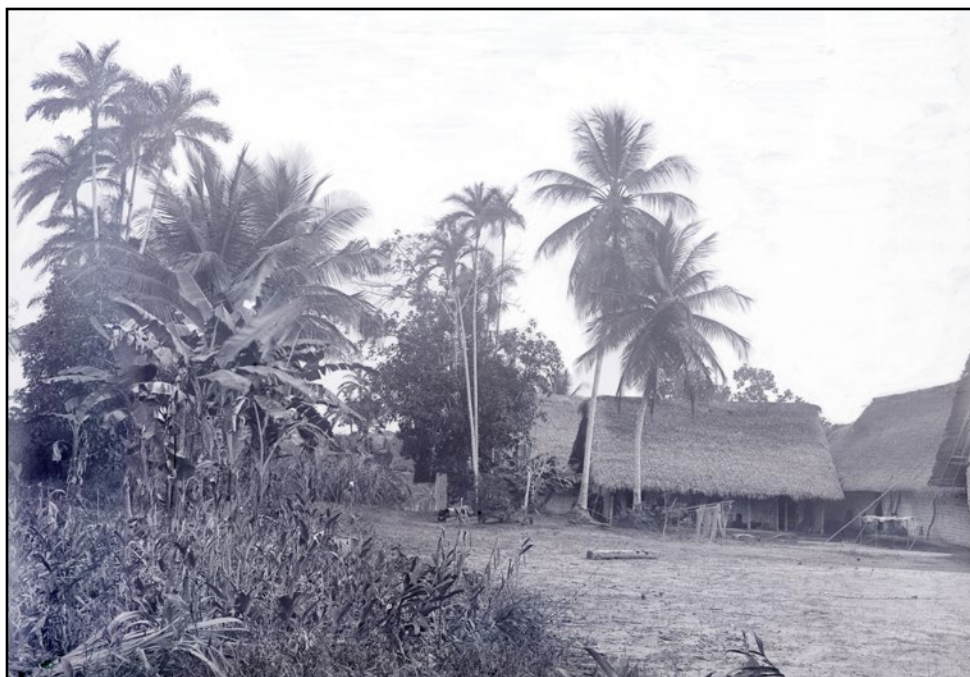
Fig. 11. Village green in San Antonio de Yavita with a field in the foreground. Inv. No. Am I 6056.