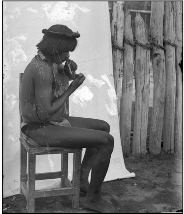
Fig. 8. Guahibo man with feather headdress snorting hallucinogenic ñopo powder. Inv. No. Am I 6094.

and, least frequently, harpy eagles' down and feathers. 67 This observation from Vráz is more or less matched by the expert identification of feather ornaments given in the table at the end of the article [Tab. 1]. It is because of their feathers that the Indigenous inhabitants of the Amazon domesticated the birds (young or injured individuals) and kept them at home. Vráz mentions that he has seen parrots, some species of songbirds, and harpy eagles in Amazonian households. 68 The Amazonian Indigenous people stored feather ornaments in a similar way to Vráz, hanging them from the ceiling on forks or on ropes made from plant fibres, and storing the rarest pieces in baskets or bags made from palm leaves. 69