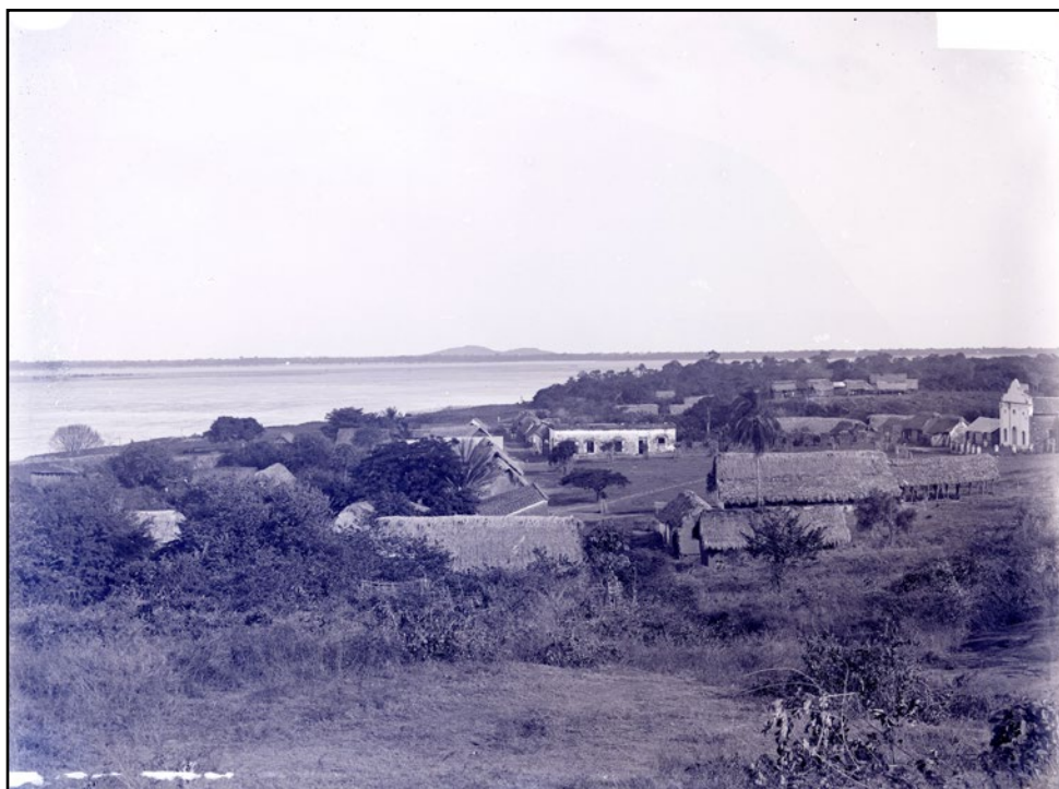
Fig. 3. View of the town of Caicara on the banks of the Orinoco River with farm buildings and church.