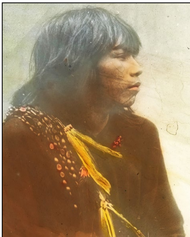
Fig. 13. Portrait of a Shipibo man from Peruvian Amazonia with feather ornament. NpM, Ethnographic Photographic Collection, Inv. No. Am II 3656.

ornaments in the market in Yurimaguas and from there sent them on the steamer Sabia to Iquitos and on to Manaus in September 1893. It is to these ornaments that Frič seems to be critically referring to in his book Indians of South America when he writes about 'the Náprstek Museum, where there is plenty of room for fake Indian ornaments, bought in the port cities of South America, which glisten with novelty.' 109