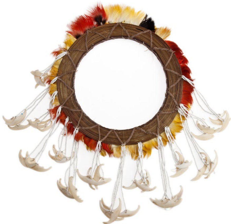
Pl. 14. Feather ornaments of the Záparo ethnic group. Inv. No. A7009.