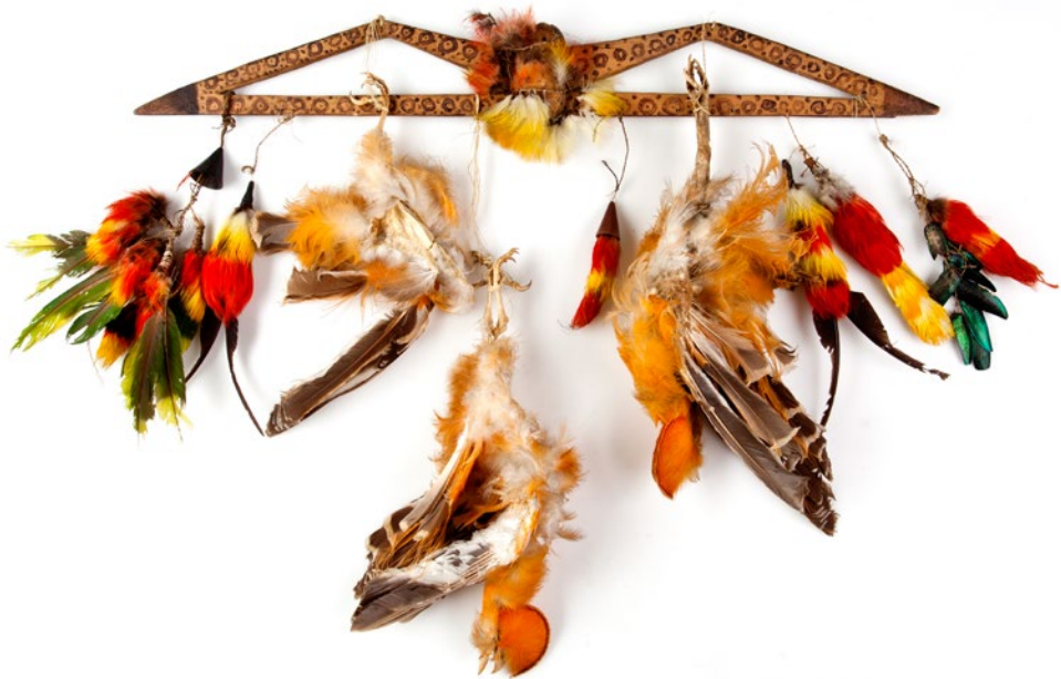
Pl. 4. Feather ornament of the Yekuana (also called Maquiritare) ethnic group. Inv. No. 45499.