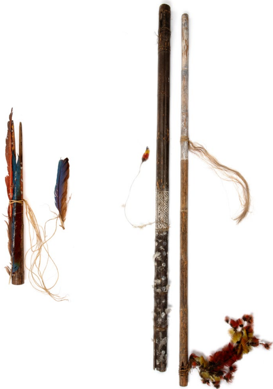
Pl. 6. Ethnographic artefacts and feather ornaments of the Baniwa ethnic group. From left: Inv. Nos. 45454, 44445, 45449.