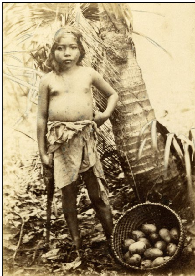
Fig. 6. Girl of an unspecified group of Indigenous people working in a coffee plantation in Maturin.