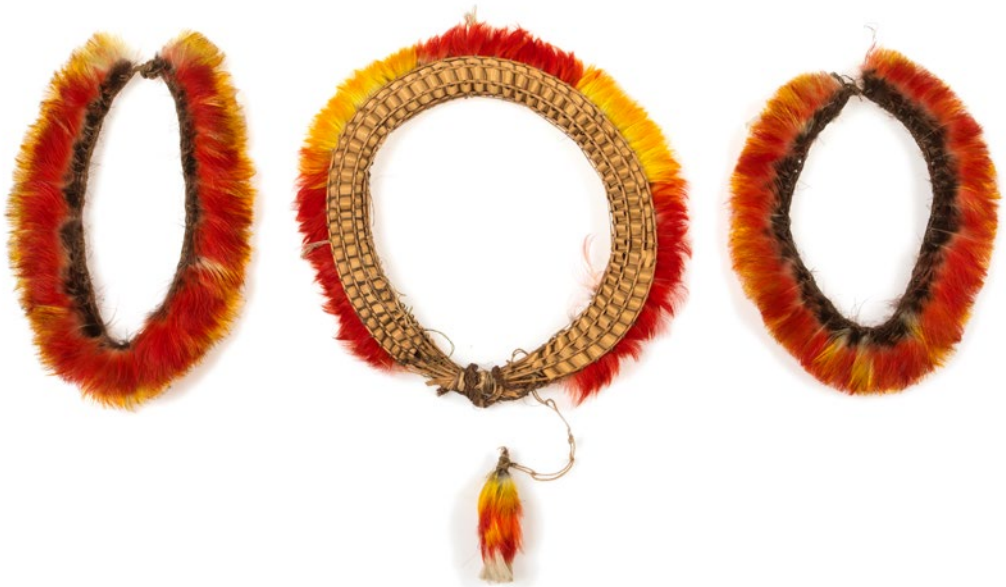
Pl. 8. Feather ornaments of the Baré ethnic group. From left: Inv. Nos. 45811a, 45810, 45811b.