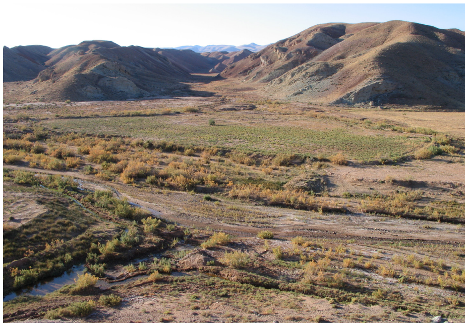
Fig. 2. The landscape of the ancient salt mine of Chehrabad, Zanjan Province, north-western Iran. A view out of the mine.

The two partly mummified specimens from Chehrabad are here compared with population samples of other small Eptesicus bats from Eurasia. This study follows the previous comparison by Benda & Reiter (2006) and is extensively complemented of new comparative material of the relevant populations, including some type specimens. For comparative morphological and morphometrical purposes we used skulls, from external dimensions we took only the forearm length (LAt). The specimens were measured in a standard way using mechanical or optical callipers. Horizontal dental dimensions were taken on cingulum margins. The examined museum comparative material is given in Appendix. We evaluated 15 craniodental dimensions in each skull (13 measurements in the skull and maxillar tooth-row, three measurements in the mandible and mandibular tooth-row; for particular dimensions see Abbreviations) plus five indices that described the skull shape. Statistical analyses were performed using the Statistica 6.0 software.