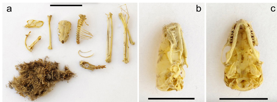
Fig. 1. Disassembled remains of a mummy of Eptesicus gobiensis discovered in the ancient salt mine of Chehrabad; a – parts of the skeleton and pelage; b – lateral view of skull and mandible; c – ventral view of skull and mandible. Skale bars: a = 20 mm, b, c = 10 mm.

Two mummified individuals of small bats were found in an ancient salt mine at the village of Hamzehlu in 2011; one complete skeleton, one partial skeleton (with broken long bones and without skull), both associated with parts of the pelage (Fig. 1). The mine lies 4 km N of Chehrabad (correctly transliterated from the Farsi script as Chehrehabad) that gave its name to the ancient site, and 60 km WNW of Zanjan, Zanjan Province, Iran; 36°54'51"N, 47°51'25"E, ca. 1350 m a. s. l. (Fig. 2).