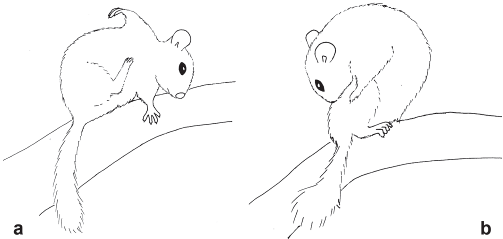
Fig. 1. Examples of comfort behaviour of the edible dormouse: a – cleaning by hind foot, b – cleaning by teeth.

When analyzing the different types of behaviour, the classification by SOKOLOV et al. (1996) was used. All contacts between individuals for the period of video recording were registered separately. The total number of contacts of different types was counted. Although the total number of animals involved is unknown, the overall period of recording allowed the evaluation of the ratio of contacts of different types.