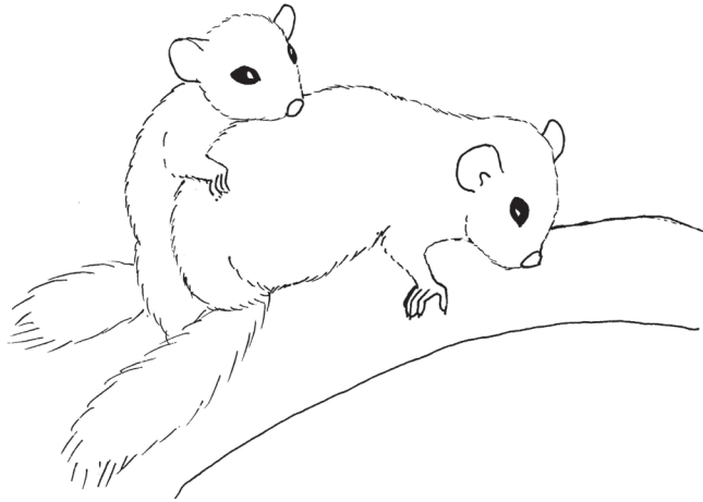
Fig. 4. Grooming at sexual behaviour in the edible dormouse. Obr. 4. Pěče (grooming) při pohlavním chování plcha velkého.

side-tail-paws, side-head-paws, head-abdomen-sides, abdomen-side-head, back-side-tail-head etc. were observed (Fig. 1a, b). Cleaning was done, mainly by teeth and forepaws, less often by hind feet. Most often comfort behaviour was observed after sleeping and after eating. This suggests that comfort behaviour is of great importance for the nocturnal dormice, perhaps to protect them from predators, since it reduces the probability of their detection by smell.