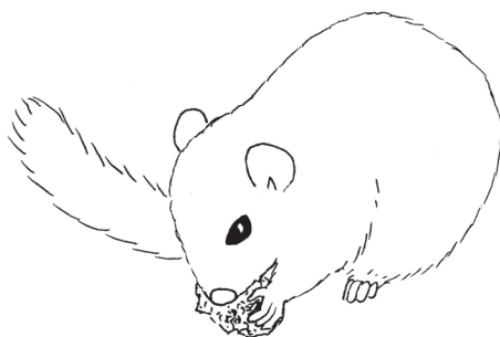
Fig. 2. Typical posture of the edible dormouse in feeding behaviour.

Obr. 2. Typický postoj plcha velkého při potravním chování.