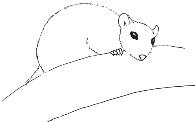
Fig. 3. Example of rubbing with cheekbones – an element of marking behaviour in the edible dormouse.

Comfort behaviour encompassed a large part of the time budget of the animals and was the most common form of behaviour. The elements of comfort behaviour were scratching, licking, washing, yawning and stretching. Usually, complex cleanings were recorded, including scratching and licking. Cleaning schemes could be very diverse and did not have fixed patterns, as they do for example in aquatic mammals (MAHOTKINA & RUTOVSKAĀ 2013). Sequences such as