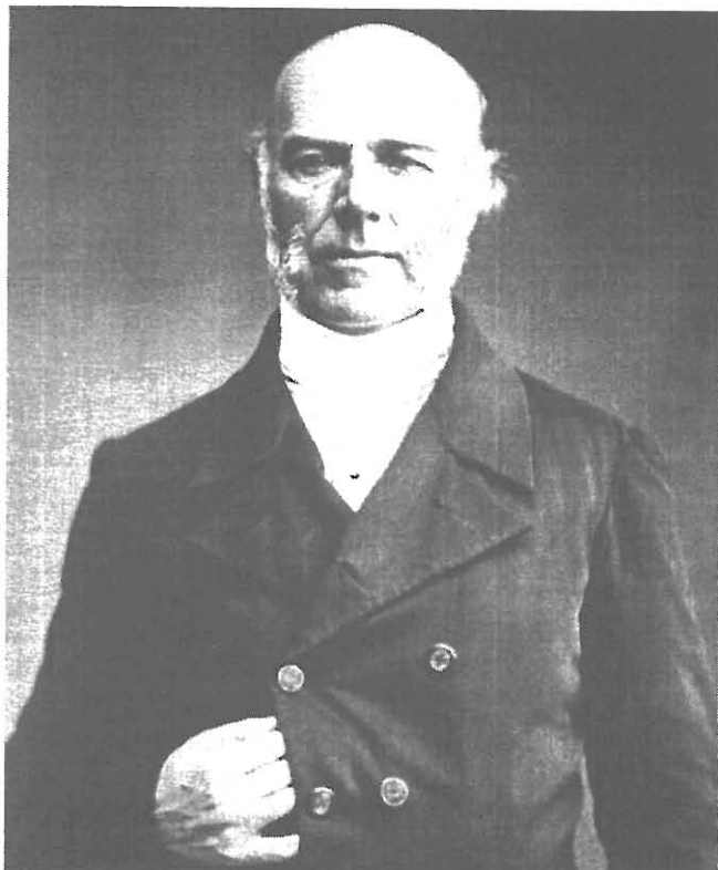
Joachim Barrande, 1799-1883

ighbouring regions (e.g. Sardinia, France, Spain, Portugal, Great Britain, or Russia). As a whole, the Barrandian gastropod and tergomyan fauna belongs to the Peri-Gondwanan province, with episodic influence of rare thermophilic immigrants from